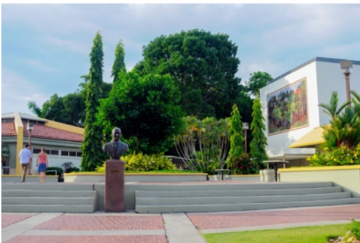
Illustration de la couverture :