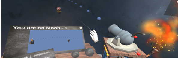
Figure 2. Exercise 2 – Parabolic trajectory (Condition 1).