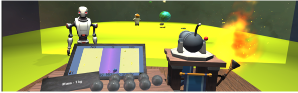
Figure 3. Exercise 3 – Parabolic trajectory and Gravity (Condition 3).

each shot, the student sees only the beginning of the predicted trajectory before the gravity sandwich. There are eight 1 kg projectiles on each platform. The student can watch the full trajectory when the shot is fired on a 2D orthographic video monitor.