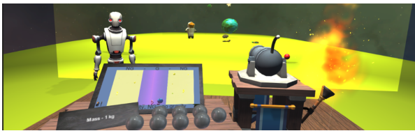
Figure 3. Exercise 3 – Parabolic trajectory and Gravity (Condition 3).

each shot, the student sees only the beginning of the predicted trajectory before the gravity sandwich. There are eight 1 kg projectiles on each platform. The student can watch the full trajectory when the shot is fired on a 2D orthographic video monitor.