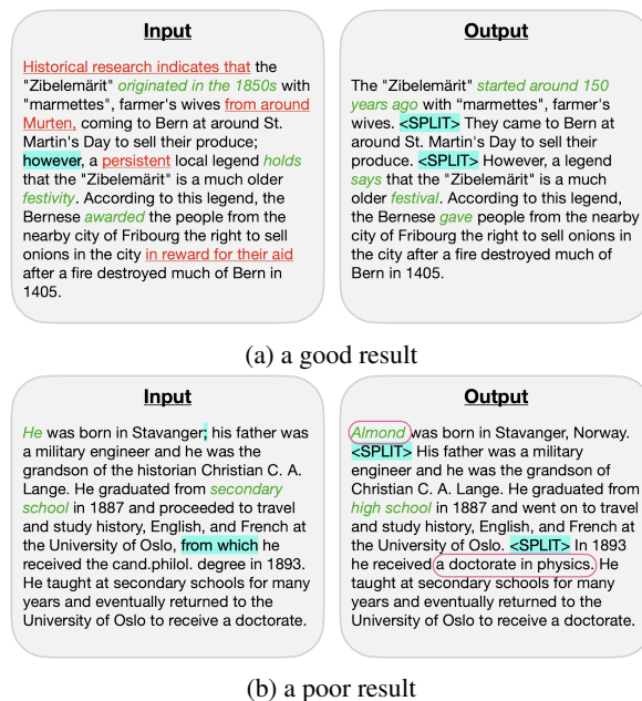
Figure 2: Example WikiLarge simplification output extracts from \hat{O} \rightarrow \text{LED}_{\text{para}} (a target reading-level of 3 was used in each case). Note that these are small extracts from larger documents shown in Appendix E. Deletions are underlined and in red ; rephrasings are italicised and in green ; splitting points are highlighted in cyan ; and factual errors are circled.

Another interesting observation is the relatively