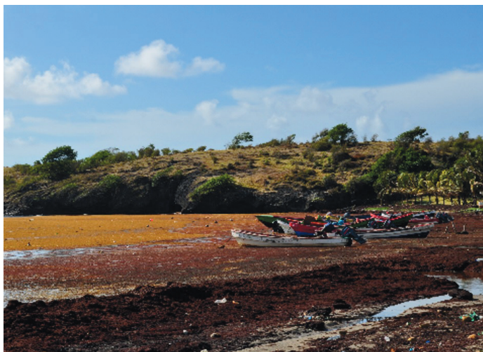
Photo: Fishing village of Praslin, Saint-Lucia east (Atlantic) coast. Source: personal collection of Keats Compton, a member of the group. He has provided consent to publish.

the upper respiratory tract mucosa and causes histotoxic hypoxemia and respiratory depression by exerting an inhibitory effect on cytochrome oxidase A3 [5]. There is no evidence for specific treatment, as even a large dose of Hydroxocobalamin does not seem to rely on the trapping of H 2 S.