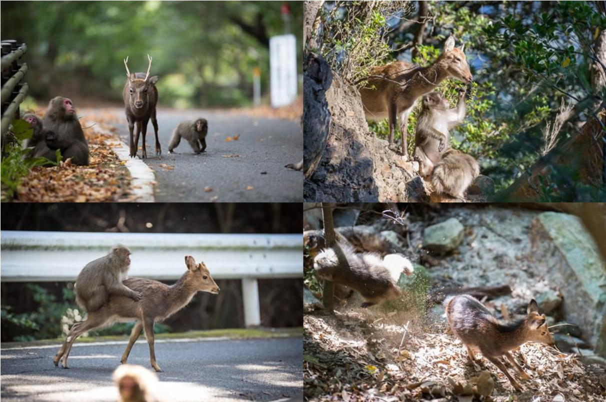
Figure I: Proximity between Japanese macaques and Sika deer (top left) leads to interactions such as grooming (top right), riding (bottom left) or play (bottom right).

cultural evolution, resulting in evolutionary trajectories that are primarily driven by cultural factors. Such reciprocal dynamics between the populations of these species highlight the intricate relationship between genetic and cultural evolution, as depicted in the subsequent figure featuring Japanese macaques and Sika deer, demonstrating the complex mechanisms at play in evolutionary processes.