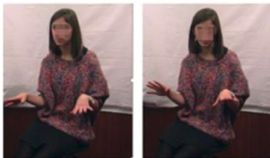
Fig. 2 pronunciation-related multimodal communication strategy (Kosmala, 2021 p. 258)

Building on the work of Gullberg, Kosmala (2021) examined an instance of pronunciation-related difficulty during an interaction between an American L2 learner of French and a native French speaker where NNS had difficulty with the pronunciation of a word in her target language, and visibly requested assistance by gazing towards her interlocutor, and keeping her hands in the same position (Fig.2). NS understood her partner’s request and took the floor to provide phonological repair.