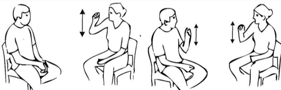
Fig. 1. Lexical multimodal communication strategy (Gullberg, 2011, p. 140)

she showed that learners tried to resolve these problems by using temporal adverbials (“yesterday”, “tomorrow”) or by making use of their gesture space. Regarding lexical difficulties, Gullberg analyzed one example in which the learner did not know the word for “to paint” in her target language (French) and produced a “painting” gesture (holding her right hand in a fist and moving it repeatedly up and down to represent the action of painting) and maintaining her gaze towards her interlocutor (Fig.1). The native-speaker, while providing corrective feedback, repeated the same gesture (Debras et al., 2015, 2020), leading to a joint co-construction.