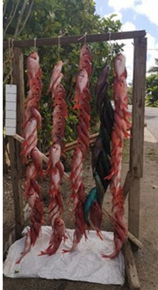
Fig. 1. Traditional road-side fish stall in French Polynesia, consisting of five « tui » (fish hanging along a rope). The white scale on the left has incrementations (black lines) of 5 cm. In total, the fork length of 1991 fish caught in the lagoon was calculated based on 2022 tui roadside surveys, fish caught during twelve fishing outings to follow different fishermen, as well as data from Lecchini (2021) .

To calculate total fishing mortality (Eq. (2)), the annual yield was calculated based on the annual landings from the consumption-based survey and from the fisherman-based survey ( Munro, 1985 ).