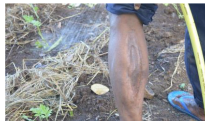
Fig. 5 A fisher bitten by a shark on the calf in Ste Suzanne (March 12, 2019)

Table 5 shows several fragments of local newspaper's articles which were relayed on social networks and had the effect of stirring up conflictual relations. The almost daily interactions/altercations between pro-shark fishing and anti-shark fishing stakeholders on the Facebook pages of the CSR and some associations, show the extent to which the emergence of conflictual situations result from the occupation of the media place. The shark fishing matter is also a rather political issue insofar as people use words and arguments that go beyond local issues to challenge political risk management choices. What's more, the majority of participants who mentioned the shark risk management