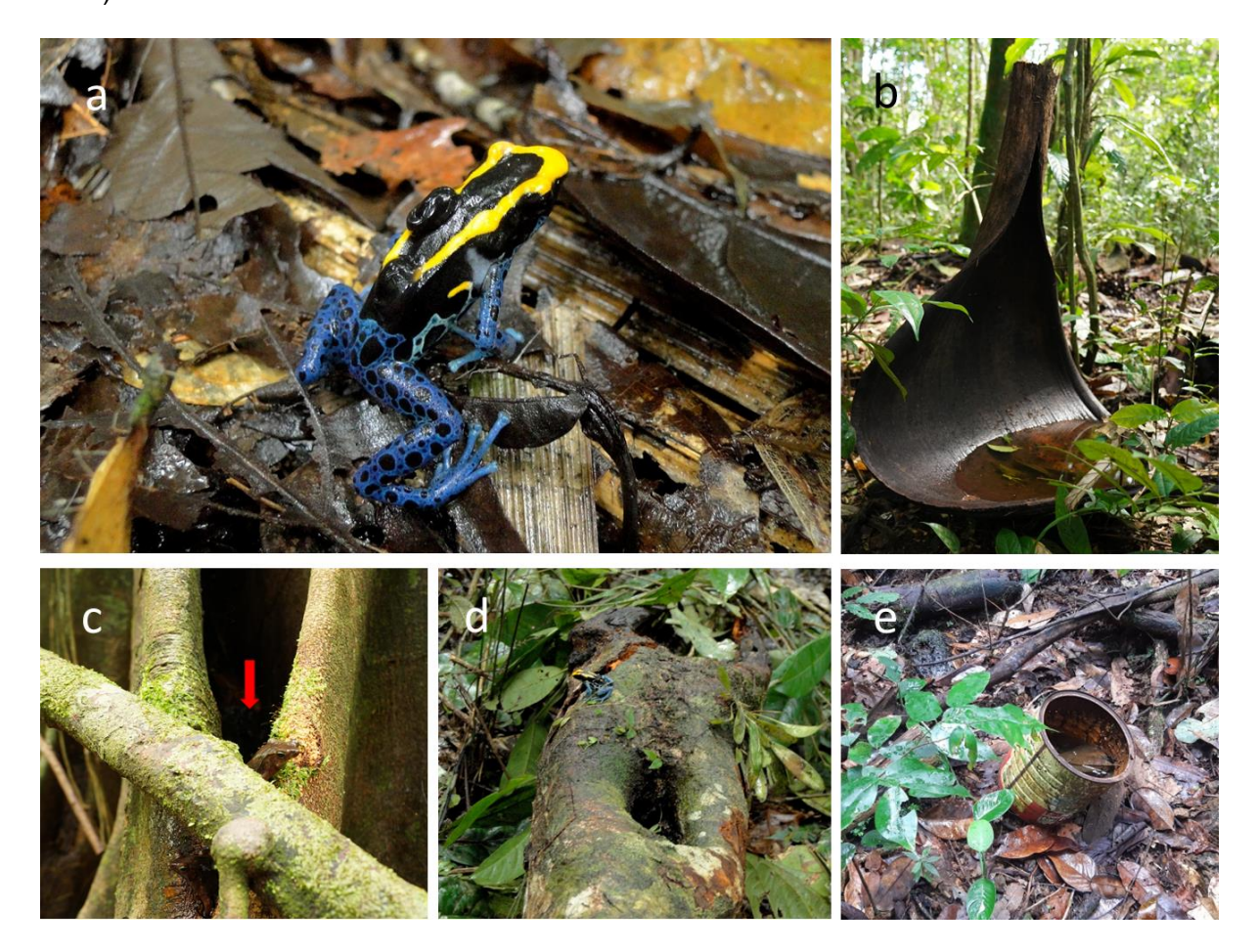
Figure 1. A male Dendrobates tinctorius carrying two tadpoles on his back (a) and the diversity of sampled pool types used as tadpole-rearing sites. Pools used include phytotelmata formed in palm bracts (b), trunk/root holes (c) and fallen trees (d), as well as artificial pools formed in anthropogenic litter (e).

which is reached after 2-3 months (Rojas and Pašukonis 2019). D. tinctorius was declared a protected species in French Guiana in 2020 (Decree No. TREL2032100A from November 19th 2020).