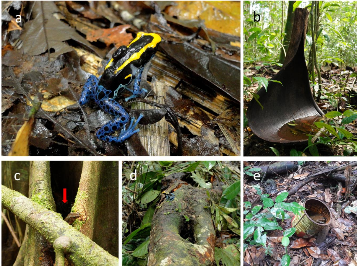
Figure 1. A male Dendrobates tinctorius carrying two tadpoles on his back (a) and the diversity of sampled pool types used as tadpole-rearing sites. Pools used include phytotelmata formed in palm bracts (b), trunk/root holes (c) and fallen trees (d), as well as artificial pools formed in anthropogenic litter (e).

which is reached after 2-3 months (Rojas and Pašukonis 2019). D. tinctorius was declared a protected species in French Guiana in 2020 (Decree No. TREL2032100A from November 19th 2020).