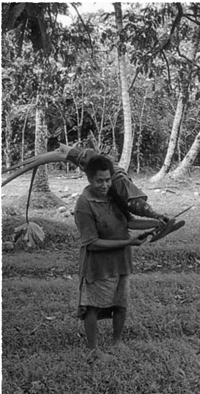
A farmer brings her selected taro for a competition, Vétuboso, Vanua Lava.

However, agroenvironmental constraints are not the only reason for the genetic erosion of taro. Even in mountainous villages where taro gardens are accessible, diversity is at risk because of a rapid loss of knowledge. During a one-week survey in Central Pentecost, 164 taro cultivars could be named but only 20 of