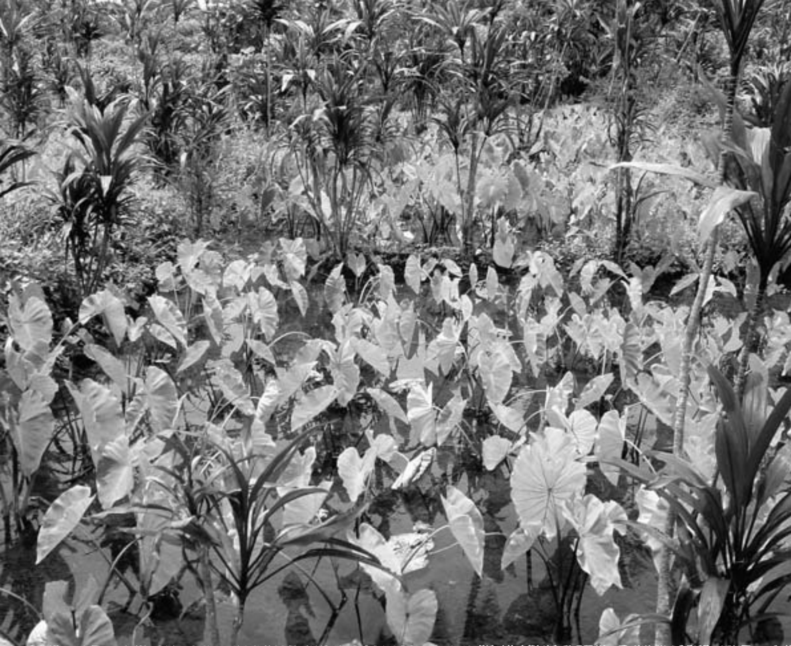
Taro pond field, Vêuboso, Vanua Lava.