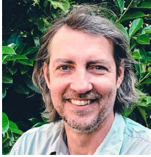
Professor Mark Pelling, UCL

Research grants: Current grant funding landscape and its pressures, including a range of funding mechanisms and key elements in drafting a grant proposal.