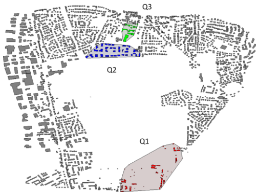
Figure 3: Visualization of Clusters Matching Query Signatures

As can be seen, the algorithm rediscovered the same region with a majority of light buildings identified by the popular signature clustering algorithm but no other regions which match this signature. Moreover, a single region which almost perfectly matches the popular signature Q3 was found. Finally, we were able to find a single region with a mixture of schools and single houses, but the match of the regions' signature with Q2 is of medium quality, as the Euclidian distance between the two signatures is about 0.047.