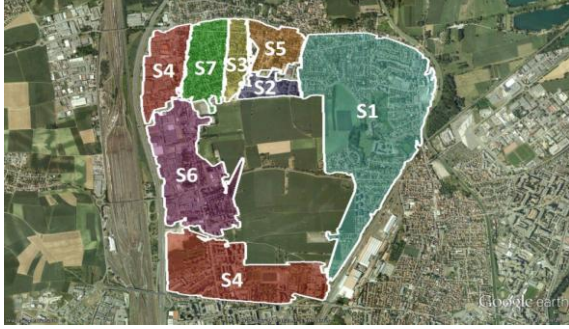
Figure 2: Example of a Spatial Clustering of Buildings Annotated by Popular Signatures.

seeks to find popular signatures which occur frequently in contiguous subspaces of the area of interest and then uses these signatures to annotate urban patches, as depicted in Figure 2.