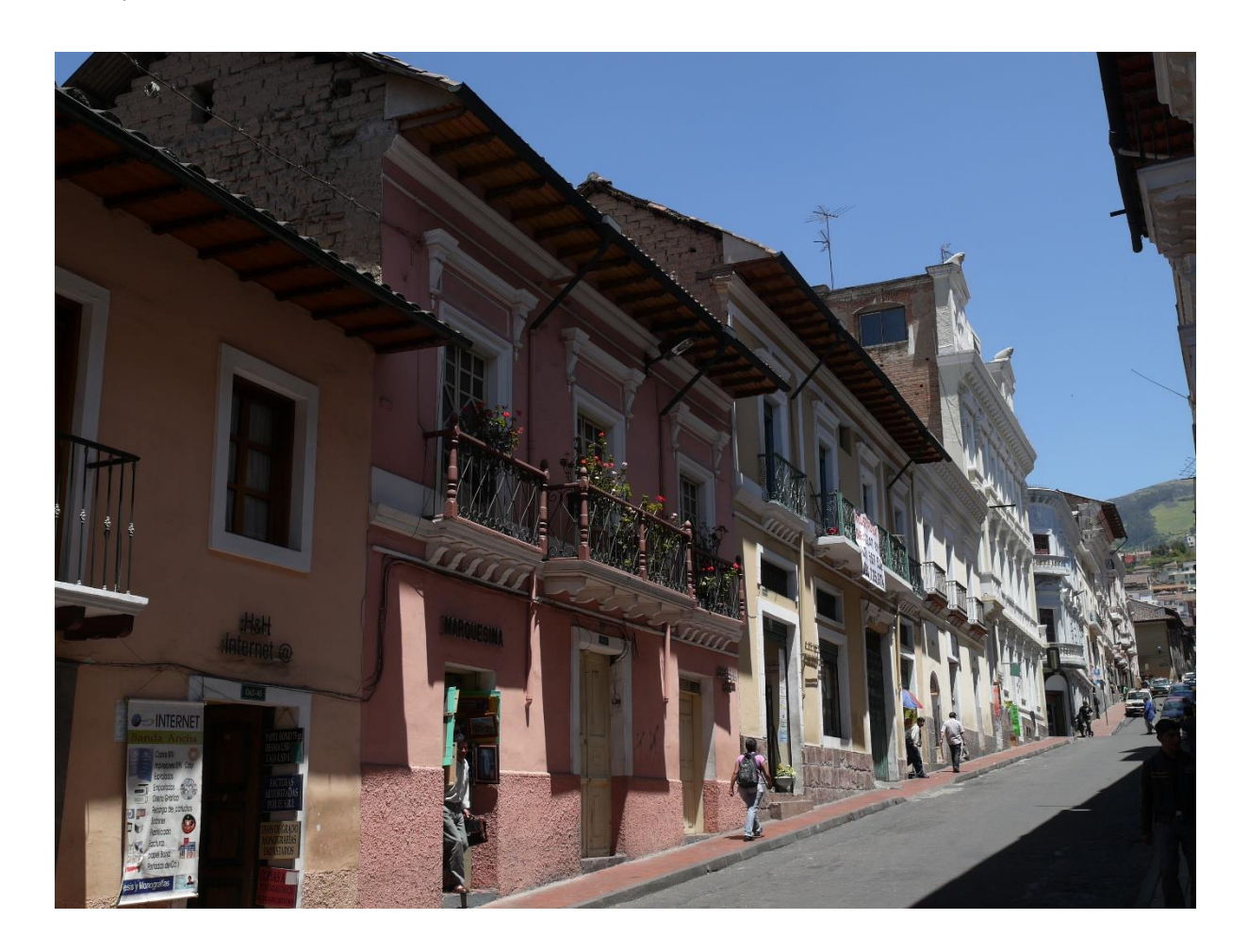
Fig. 2. Main street of La Croix Rousse, a quarter of Lyon part of its World Heritage sector.

Fig. 1. The historic city center of Quito, Ecuador, inscribed in 1978