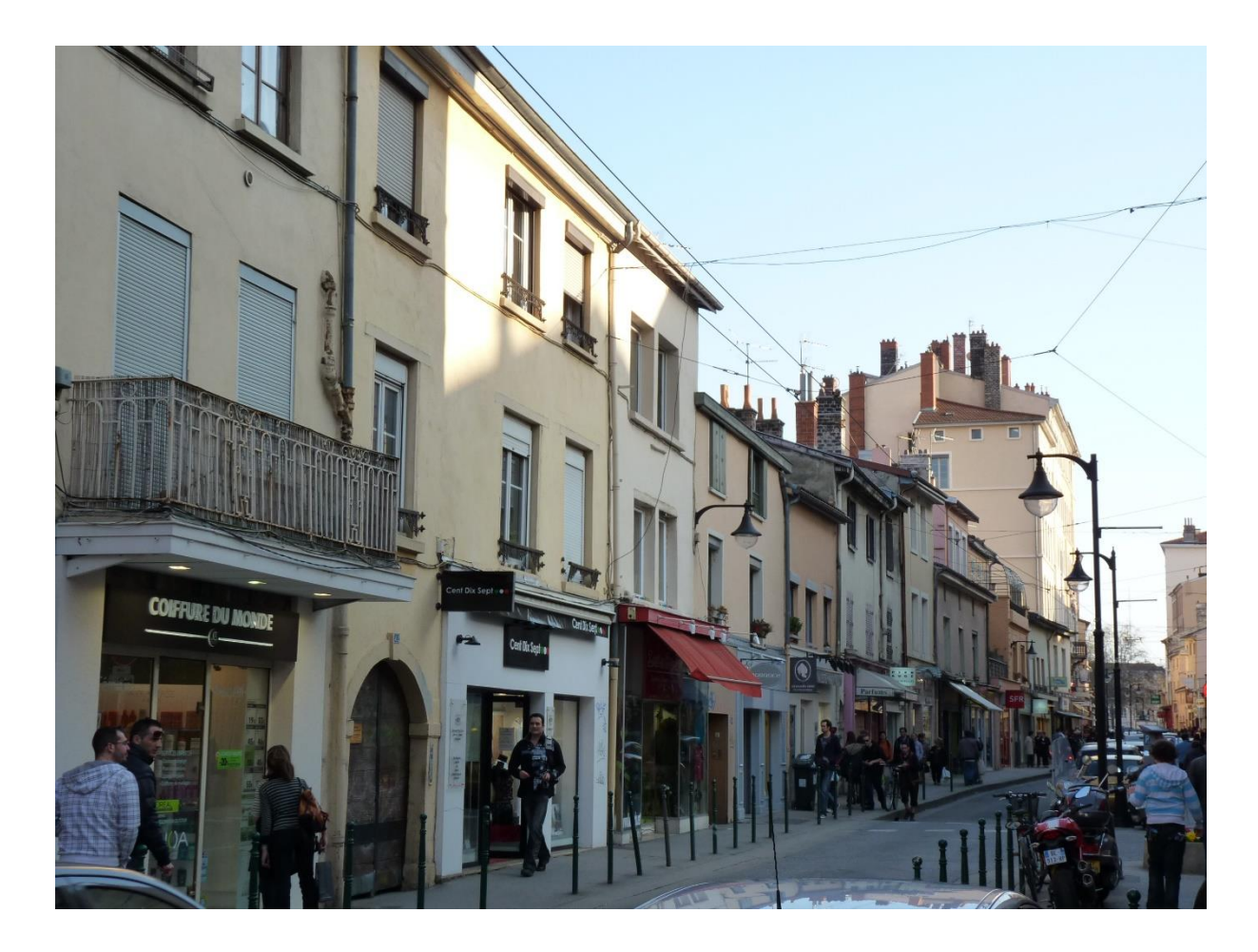
Fig. 3. The historic centre of Agadez, inscribed in 2013.