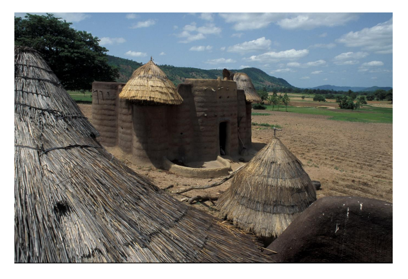
Fig. 6. Maintenance of the Friday mosque in Bandiagara by the local community under supervision of their master masons, may 2007.