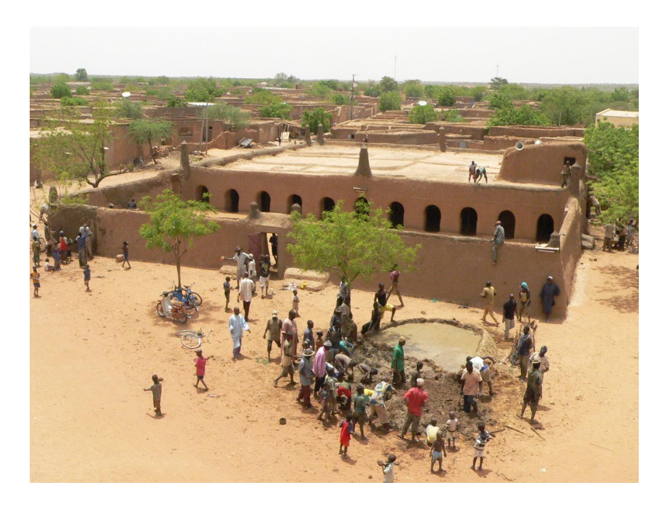
Fig. 7. The old town of Ghadames, Libya, inscribed in 1986, and on the World heritage list in danger since 2016.