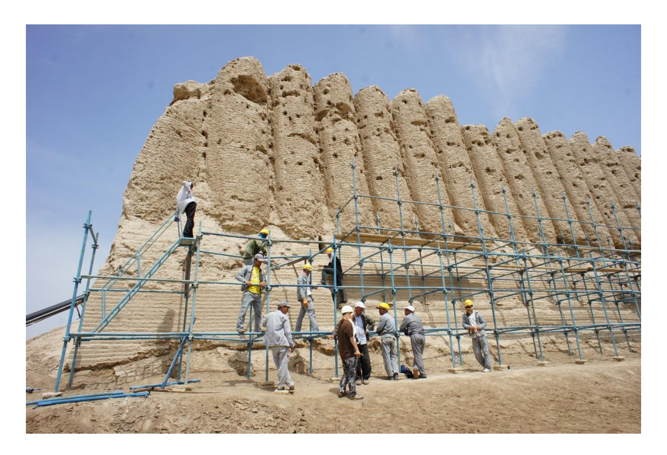
Fig. 5. Koutammakou, the land of the Batammariba in Togo, inscribed as a cultural landscape in 2004.

Fig. 4 : The great Kiz Kala, Merv Turkmenistan under restoration (2015 campain).