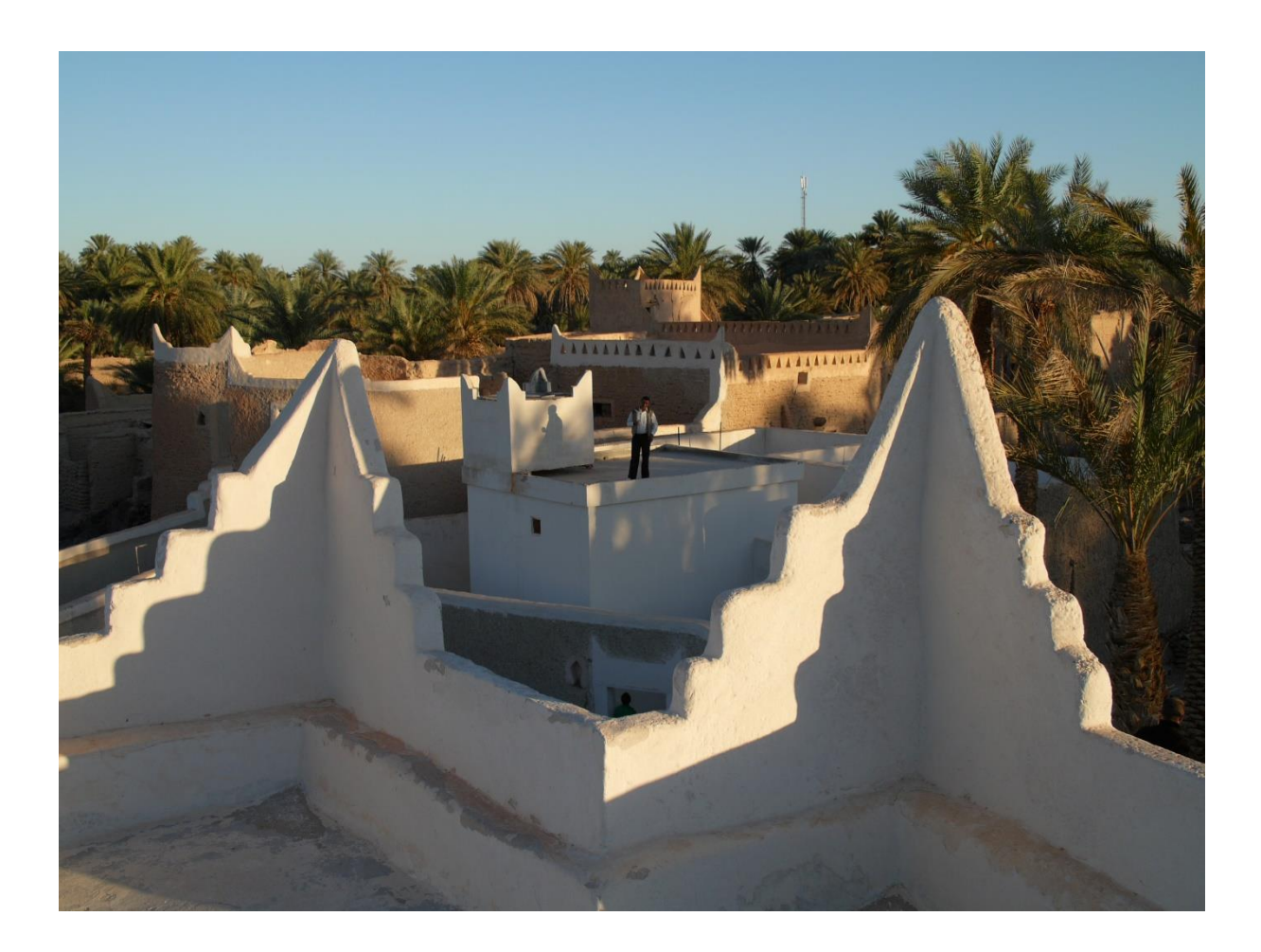
Fig. 8. The old city of Yazd, Iran, inscribed in 2017, currently subject to reverse-design works in view of developing adaptations to contemporary needs.