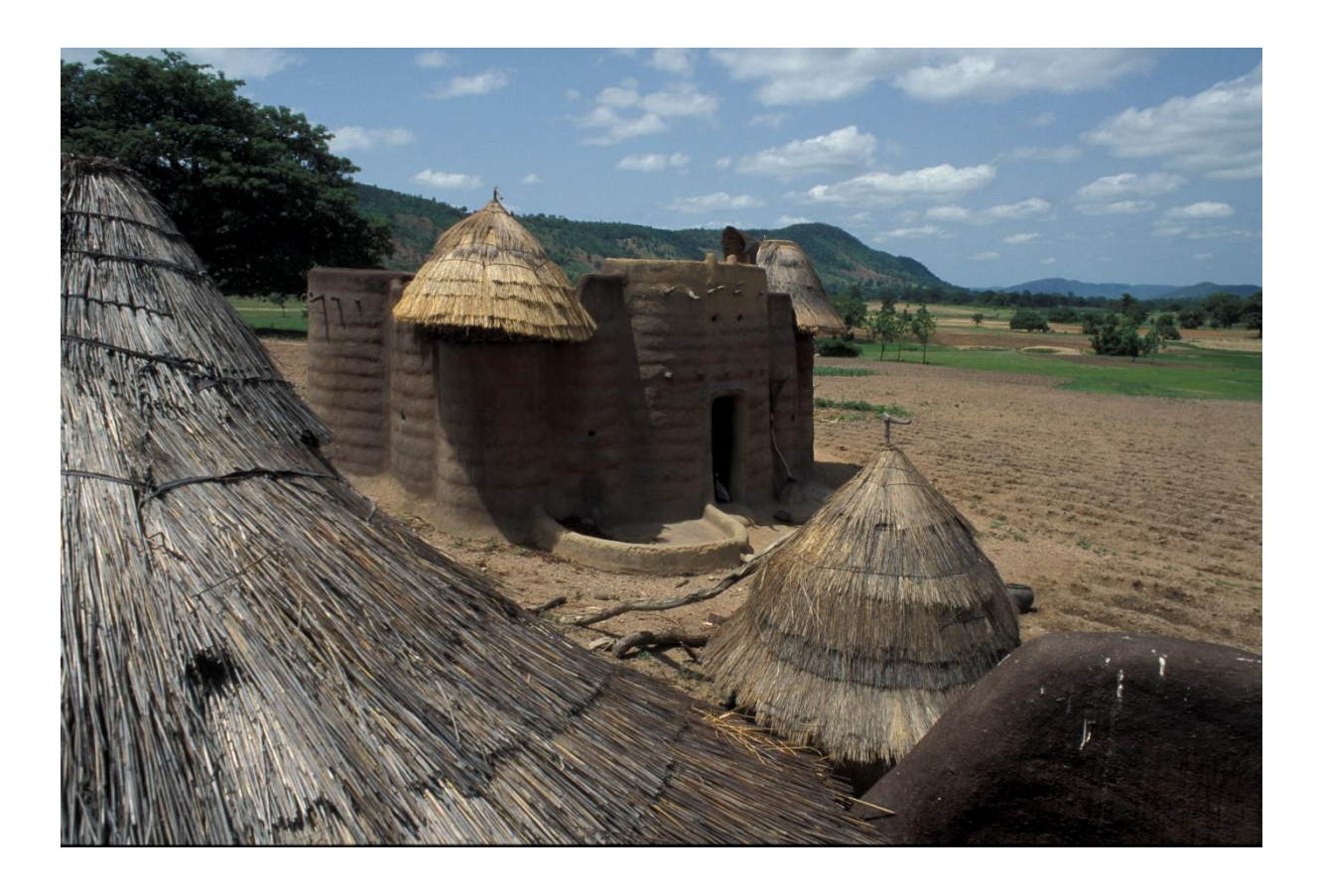
Fig. 6. Maintenance of the Friday mosque in Bandiagara by the local community under supervision of their master masons, may 2007.