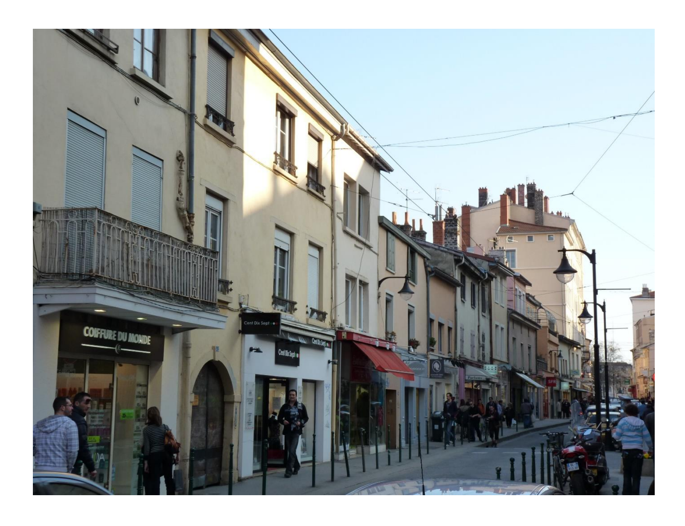
Fig. 3. The historic centre of Agadez, inscribed in 2013.