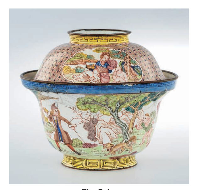
Fig. 9. b.