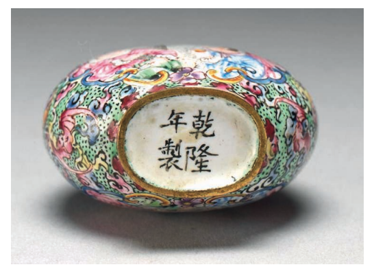
Fig. 2. a.