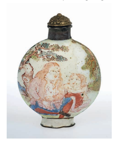
Fig. 5. – Snuff bottle with Westerners, early 18<sup>th</sup> century, 5,5 x 4,6 x 1,6 cm (Shuisongshi Shanfang 水松石山房)

Private collection