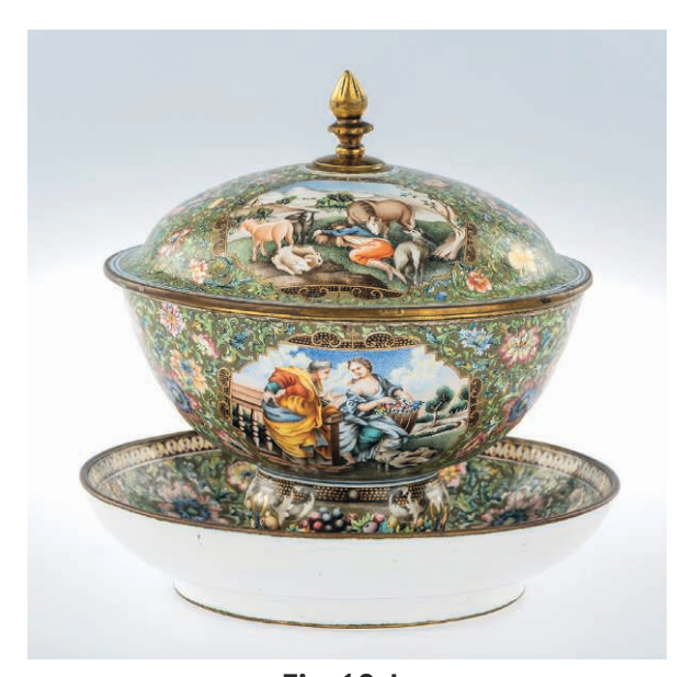
Fig. 10. b.