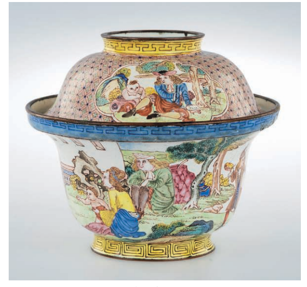
Fig. 9. a.