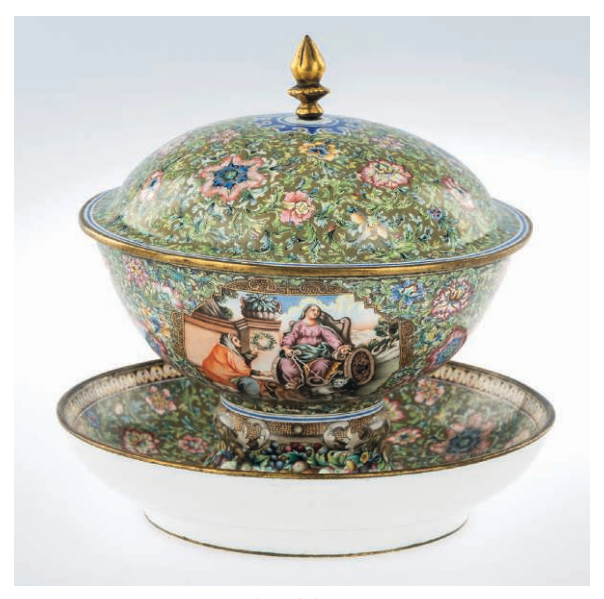
Fig. 10. a.