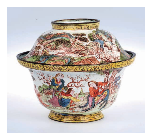
Fig. 4. – Covered cup with Westerners in landscapes, 18<sup>th</sup> century, 9,6 x 12,9 cm

Private collection, photos courtesy of Art Museum, the Chinese University of Hong Kong.