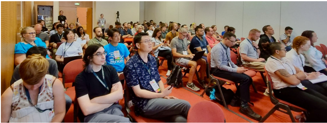
Figure 1. A full room at BOSC 2023 in Lyon, France. BOSC, Bioinformatics Open Source Conference.