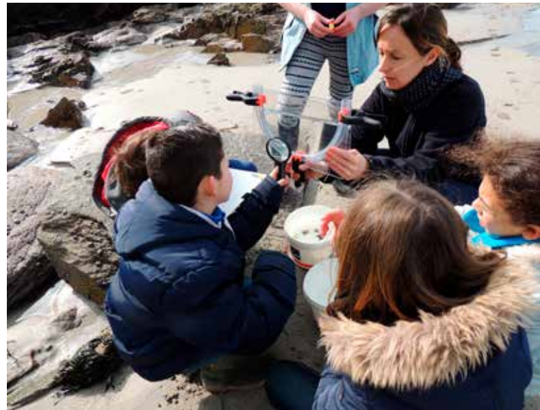
Educational activity with a class from the Jean Monnet school in Le Conquet at the Iroise Marine Nature Park