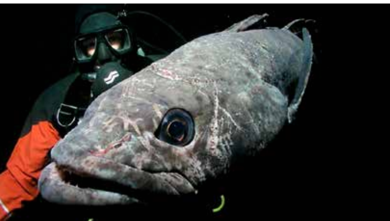
Research and monitoring in the Ross Sea MPA in the Antarctic. Antarctic toothfish and diver

Unlike other Regional Sea Conventions, the Commission for the Conservation of Antarctic Marine Living Resources has a mandate to regulate all harvesting activities. Moreover, the countries which have activities in this area are included in the 25 Members of the Commission. The adoption of the creation of MPAs can be complex, however. An EU-Franco-Australian project for the creation of an MPA in eastern Antarctica, covering about one million square kilometers, was not endorsed because of the concerns of some Member States over fishing rights in this area. To date, there are only two MPAs in the high seas.