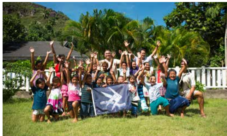
Children from the Ua Pou educational managed marine area visiting schools in Hakamaï and Haakuti on the Marquesas Islands in French Polynesia to share their experience in managing these marine areas

participatory way by primary school pupils in accordance with certain principles. The concept was born in 2012 in the Marquesas Islands in French Polynesia following discussions with pupils from a primary school in Vaitahu. French Polynesia and the founding partners have since structured the concept to create an educational label.