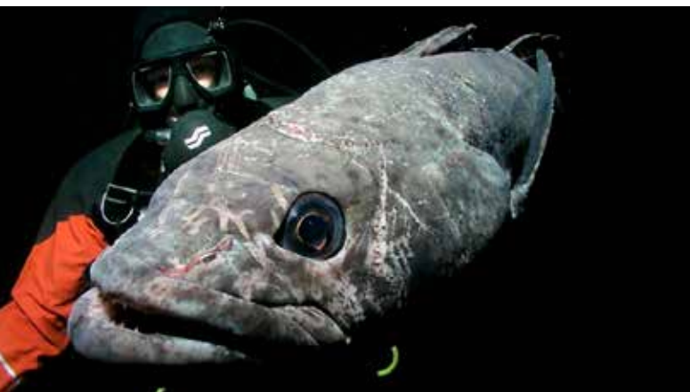
Research and monitoring in the Ross Sea MPA in the Antarctic. Antarctic toothfish and diver

Unlike other Regional Sea Conventions, the Commission for the Conservation of Antarctic Marine Living Resources has a mandate to regulate all harvesting activities. Moreover, the countries which have activities in this area are included in the 25 Members of the Commission. The adoption of the creation of MPAs can be complex, however. An EU-Franco-Australian project for the creation of an MPA in eastern Antarctica, covering about one million square kilometers, was not endorsed because of the concerns of some Member States over fishing rights in this area. To date, there are only two MPAs in the high seas.