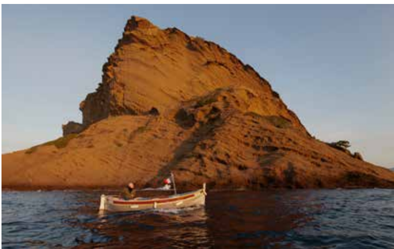
Small-scale fisheries at the National Park of Calanques, Marseille (France)

decide upon the topics to be addressed at the World Conservation Congress in Marseille. The Aichi Targets, including that related to MPAs, will be discussed in detail. The resolution of the 2016 edition of the World Conservation Congress in Hawaii encouraged Members of the International Union for Conservation of Nature to designate and implement the integration of at least 30% of each marine habitat in a network of highly protected marine areas and to take other effective conservation measures. Scientific evidence advocates the full protection of at least 30% of the global ocean to reverse current adverse impacts, increase resilience to climate change and preserve long-term ocean health.