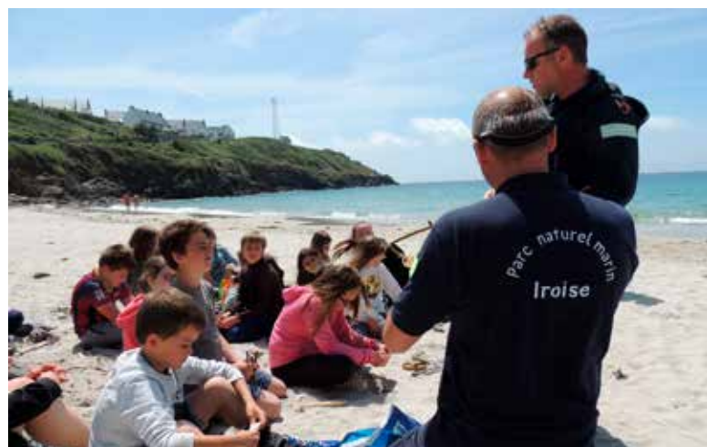
School workshop on the "noises of the sea" as part of the 2016-2017 educational program at the Iroise Marine Nature Park

T he originality of the dashboard of the Iroise Marine Nature Park lies in its deliberately highly educational focus. Overall, the work accomplished has resulted in the Park being recognized as being among the best managed MPAs since it has joined the Green List of the International Union for Conservation of Nature.