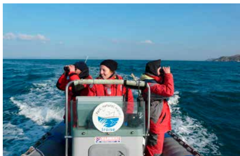
Field staff on a wintering bird counting mission in the Iroise Marine Nature Park, in Douarnenez Bay

E ach year, the Iroise Marine Nature Park publishes its dashboard showing the long-term trends regarding its health. The dashboard consists of indicators, which are simple means of assessing a complex reality, corresponding to each of the objectives of the Park's management plan. Its purpose is to measure, year after year, the state of the natural and cultural heritage, the quality of the water, the professional and the leisure activities and governance. The dashboard enables the members of the management board to understand the relevance of their actions and adapt their policies accordingly.