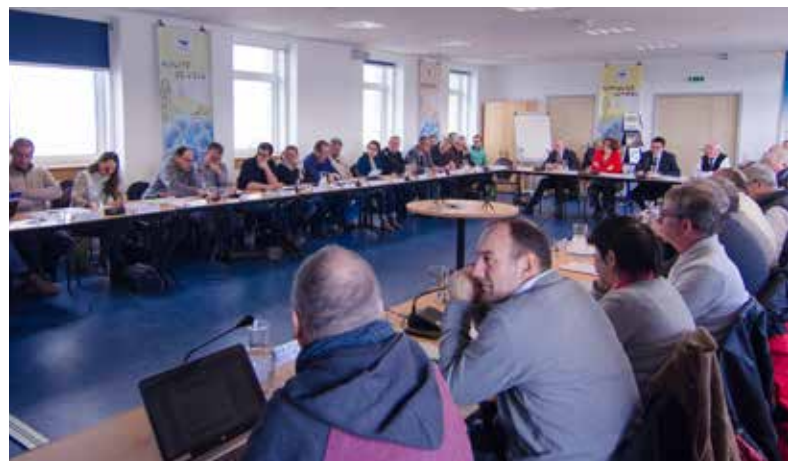
The Iroise Marine Nature Park Management Board meeting on 6 February 2018, in Le Conquet

S everal French Biodiversity Agency staff are involved in various departments in setting up, where relevant, common indicators for marine nature parks, and making them compatible with the different reporting requests for EU regulations such as Natura 2000 and the Marine Strategy Framework Directive. Today, nine parks - including the Iroise Marine Nature Park - form a network of marine nature parks, which reinforces the relevance of an evaluation system with a common base of indicators able to measure the effectiveness of these parks in taking better account of the marine environment.