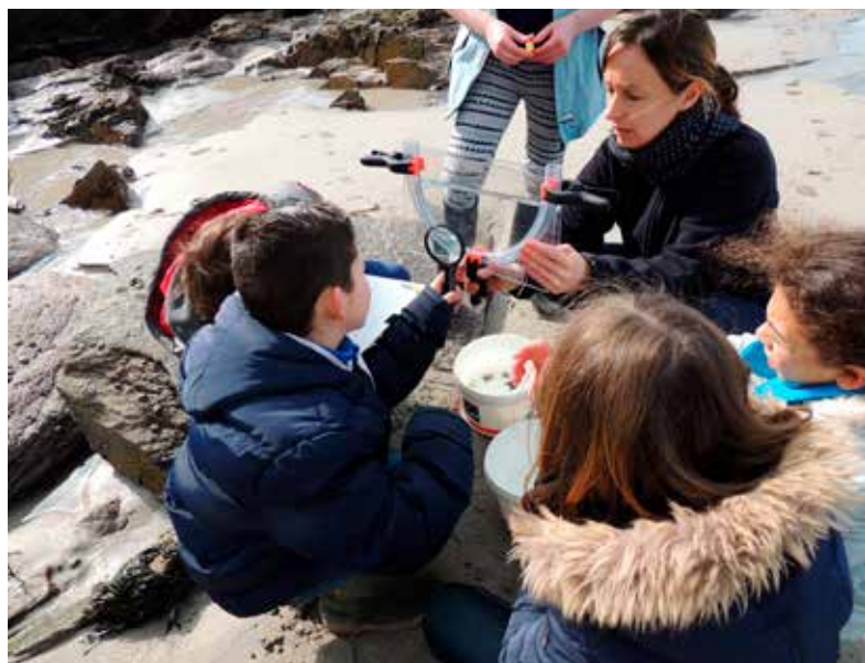
Educational activity with a class from the Jean Monnet school in Le Conquet at the Iroise Marine Nature Park

Coordinator, Fisheries Ecology Laboratory in West Africa (LEH-AO) (ISRA/CRODT and Universities of UCAD, UGB, UASZ) Dakar-Thiaroye Oceanographic Research Center (ISRA/CRODT)