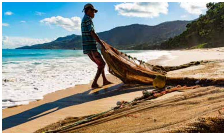
Mackerel fisherman fishing along the shore with small boats and seine nets in Beau Vallon, Mahé Island, Seychelles

In 2016, the Seychelles reached an unprecedented agreement with the NGO the Nature Conservancy to convert part of its sovereign debt into actions in favor of nature. The government has committed to protecting 30% of its maritime territory (410,000 square kilometers) through the establishment of new MPAs by 2020. In February 2018, the government confirmed the creation of two new MPAs that will cover 16% of the exclusive economic zone of the archipelago.