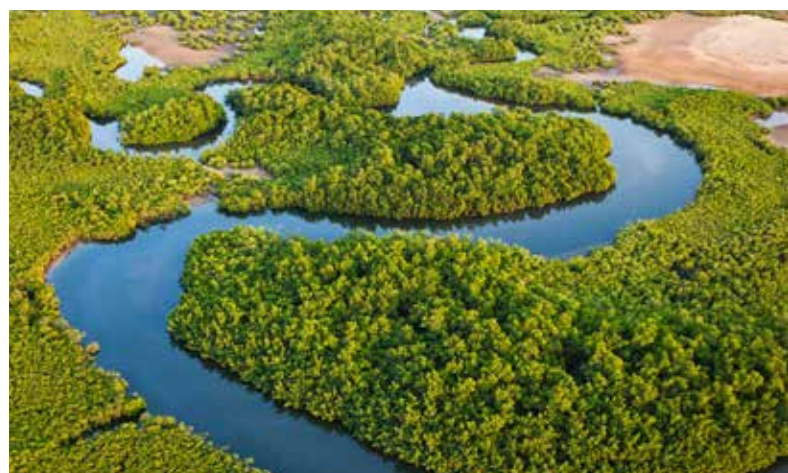
Sine Saloum Delta from the air, Bamboung MPA

G iven the failure of traditional fisheries management policies in some areas, MPAs have been promoted in Senegal as effective tools for the restoration of fishery resources and the conservation of biodiversity. The Bamboung MPA, located at the heart of the Saloum Delta Biosphere Reserve, covers an area of 7,000 hectares. It is a medium-sized bolong with very limited entry points. The Joal-Fadiouth MPA covers an area of 17,400 hectares and includes an extensive mangrove area. These two MPAs attract large numbers of tourists because of their historical,