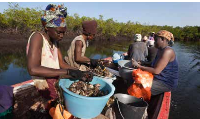
Bamboung MPA: local women have been collecting mangrove oysters since the creation of the MPA, harvesting them without cutting the roots of the mangrove trees

cultural and architectural heritage, their landscapes and their fauna (in particular, the Palearctic water birds). These assets can be used to generate income to support certain MPA management costs. The Cayar MPA of 17,100 hectares is located in an area of high productivity. It is one of the most active fishing centers in the country.