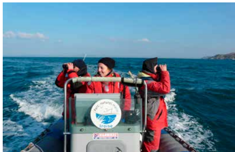
Field staff on a wintering bird counting mission in the Iroise Marine Nature Park, in Douarnenez Bay

E ach year, the Iroise Marine Nature Park publishes its dashboard showing the long-term trends regarding its health. The dashboard consists of indicators, which are simple means of assessing a complex reality, corresponding to each of the objectives of the Park's management plan. Its purpose is to measure, year after year, the state of the natural and cultural heritage, the quality of the water, the professional and the leisure activities and governance. The dashboard enables the members of the management board to understand the relevance of their actions and adapt their policies accordingly.