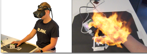
Figure 1: Participant wearing the VST-HMD, experiencing burning hands in VR and measuring the HPT.