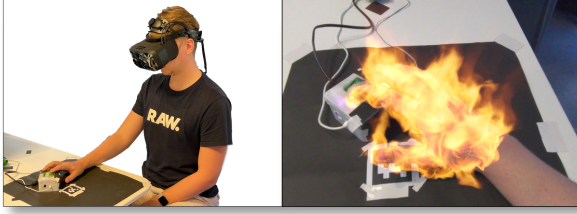
Figure 1: Participant wearing the VST-HMD, experiencing burning hands in VR and measuring the HPT.