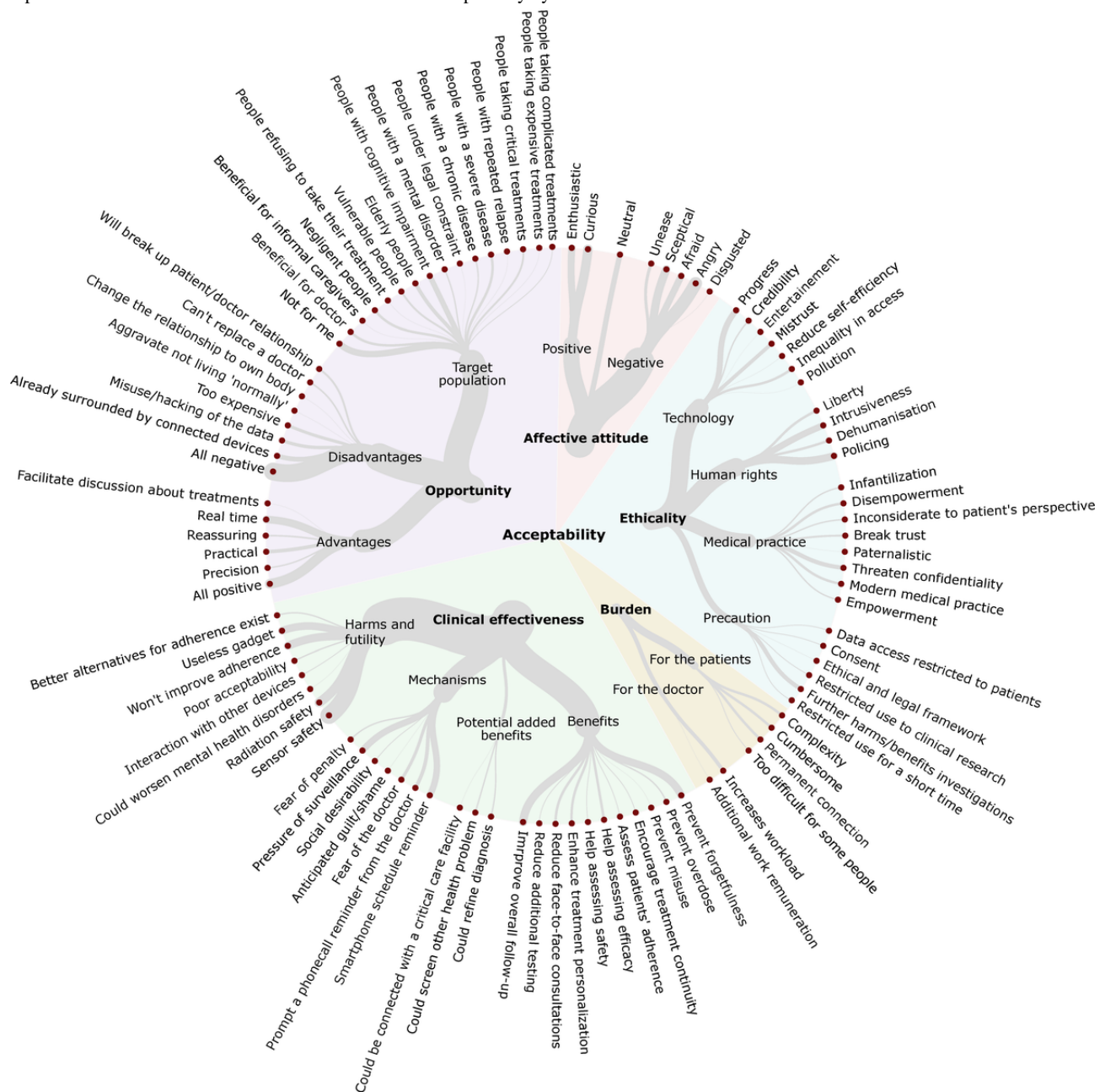
Figure 2. Acceptability of connected drugs. Dots represent codes regarding acceptability of treatments identified by the qualitative content analysis of the responses for 767 patients, 1238 public participants, and 246 health care professionals. The width of the line is proportional to the number of spontaneous citations of the codes by the representative sample of patients and public participants (N=2005). The overarching categories in bold correspond to the 5 dimensions of the theoretical model of acceptability by Sekhon et al.

In Figure 2, which shows the acceptability of connected drugs, the dots represent codes regarding acceptability of treatments identified by the qualitative content analysis of the responses for 767 patients, 1238 public participants, and 246 health care professionals. The width of the line is proportional to the number of spontaneous citations of the codes by the representative sample of patients and public participants (N=2005). The overarching categories in bold correspond to the 5 dimensions of the theoretical model of acceptability by Sekhon et al [19]. Perceived clinical effectiveness is the extent to which the intervention is likely to achieve its purpose. Perceived burden is the amount of effort required to participate in the intervention. Perceived ethicality is the extent to which the intervention fits well with individual values. Perceived opportunity is the extent to which benefits/values must be given up to engage in the