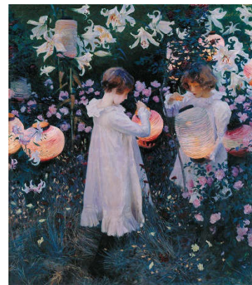
Fig. 7 - Monet C. (c. 1915-1926), Nymphéas [huile sur toile, 200 × 426,1 cm]; Fig. 8 - John Singer Sargent J. S. (c. 1885-1886) Carnation, Lily, Lily, Rose [huile sur toile, 174 × 153,7 cm].