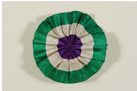
Fig. 4 - Elsie Duval's hunger strike medal (1912); Fig. 5 - WSPU postcard album (c. 1911); Fig. 6 - WSPU rosette (c. 1913).

These explanations alone do not explain this choice of colours: there was also a form of pragmatism, so that all suffragettes could easily wear the WSPU colours. As violet was fashionable – as was green (Matthews David, 2017) –, all the women had at least one item in these colours in their wardrobes, so they could assert their political allegiance without making an expensive purchase (Heller, 2000, pp. 172-173). Relying on fashion, for which women were thought to have a natural inclination, the suffragettes attempted to overcome the negative image of the feminist as “strong-minded”, i.e. masculine: “[they] used fashionable dress as a form of propaganada in the belief that ‘eccentricity’ would make the vote harder to obtain” (Ribeiro, and Blackman, 2015, p. 203). Moreover, by choosing fashion as a mode of communication, and using synthetic colours as an emblem, they were also positioning themselves as an avatar of modernity, associated with both novelty and progress, enabled by technological innovation.