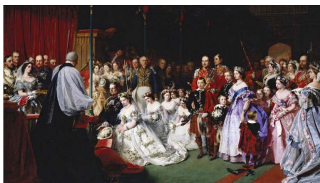
Fig. 1 - Silk purple dress, dyed with Perkin's aniline purple dye (c. 1870-1873); Fig. 2 - Winterhalter, F. X. (1854) Empress Eugénie [oil on painting, 130,8 × 96,5 cm]; Fig. 3 - Phillip, J. (1860) The Marriage of Victoria, Princess Royal, 25 January 1858 [oil on painting, 103,2 × 184 cm].

Public demand for shades of violet known as mauve, lilac or heliotrope increased further under the influence of Eugénie de Montijo, wife of Napoleon III (Fig. 2), who found mauve to perfectly match for her eyes, and Queen Victoria, at her daughter's wedding on 25 January 1858 (Fig. 3), who wore a mauve velvet train on the advice of Empress Eugénie (Garfield, 2000, pp. 58-59). Violet hues were such a craze in 19 th -century European fashion that historians sometimes refer to the European and North America last years of the 19 th century as the “mauve decade” (Delevoy, 1978, pp. 45-68; Beer, 1926). However, the British newspaper The Punch negatively described this fashion as “mauve measles”, cynically apprehending it as a disease whose “ravages are principally among the weaker sex” (Anonymous, 1859).