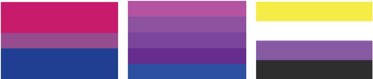
Fig. 9 - Page, M. (1998) Bi Pride Flag; Fig. 10 - Pellinen, J. (2002) Transgender Pride Flag; Fig. 11 - Rowan, K. (2014) Non-binary Pride Flag.

struggles and identities, chosen again for being the mix of the traditional “pink for girls” and “blue for boys” in one of the transgender pride flag (Fig. 10; Pellinen, 2002), and in the following decade it appeared alongside yellow, white, and black in the non-binary pride flag (Fig. 11), then representing people in between masculine and feminine gender identities (Rowan, 2014). The violet then sort of mutates into ultraviolet, a light with a wavelength outside the spectrum visible to the human eye, becoming a metaphor for a search for a “beyond gender” that refers to the end of feminine/masculine and even homo-/heterosexual binarisms.