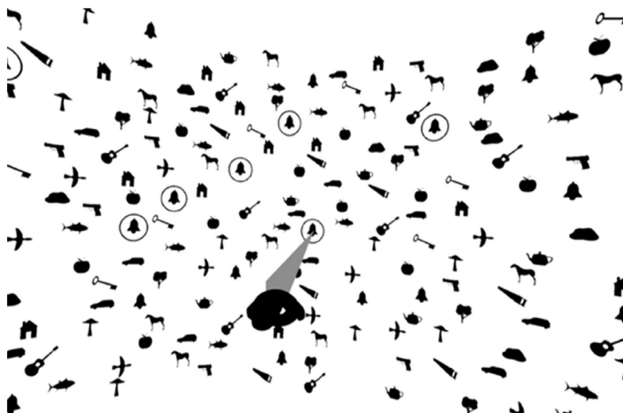
FIGURE 1 Illustration of the cancellation-task interface and the laser pointer (here in light grey for printing purposes but displayed in blue in the VR environment) emerging from the hand-held controller inside the head-mounted display.