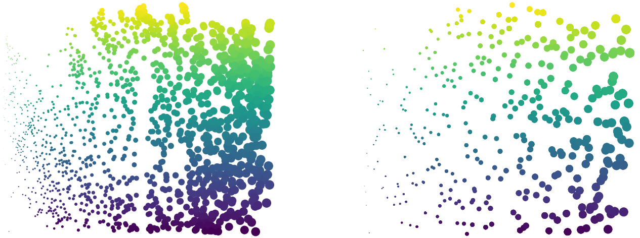
Figure 3: Example of the corpora in figure 2 after density equalisation. The colour and sizes are mapped to the same descriptors as x/y to show the low distortion this method entails.