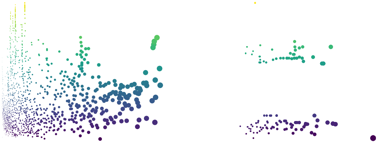
Figure 2: Example of an audio corpus (left), visualised using fundamental frequency (x), periodicity (y), and an image corpus (right), visualised using average luminance (x), dominant colour (y). Colour and size of the points reuse the same descriptors as x and y to illustrate the distortion, compared to figure 3.