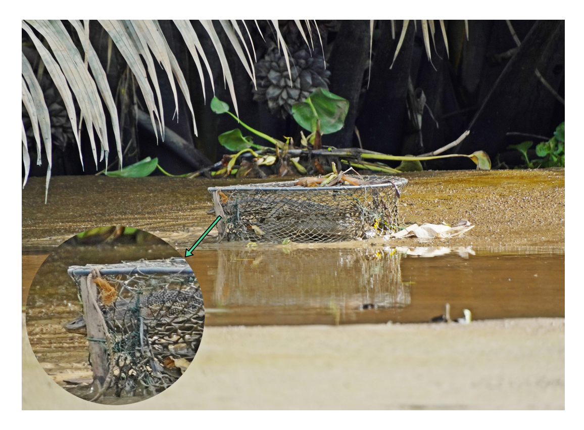
Figure 2. An adult Varanus salvator macromaculatus, recognisable by the characteristic pattern and positioning of the nostrils, caught in a circular aquatic trap.

unintended impacts of trapping monitor lizards in Sumatra, we can better inform conservation efforts and the sustainable use of monitor lizards to ensure their long-term survival in Aceh Province and beyond. Taking proactive measures to safeguard the delicate balance of local ecosystems, as highlighted by the potential threats to monitor lizards, is crucial for preserving biodiversity and maintaining the health of natural habitats (Miranda, 2017; Doody et al., 2021).