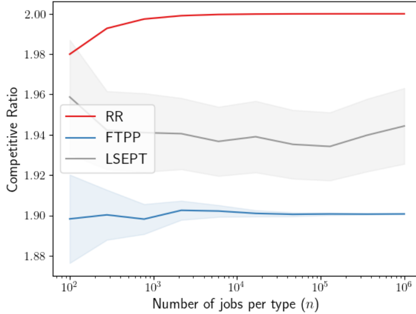
Figure 3. CR on jobs with 2 different types. K = 2 , \lambda_2 = 1 and \lambda_1 = 0.8 , n takes a grid of values.

As can be seen in Figure 3, LSEPT has better mean performance than RR, a non-adaptive method. However, it has a large variance and its performance does not improve with n . This is typical of the performance of greedy algorithms: since the algorithm commits very early, it can either get very good or very bad performances. We plot the mean over 200 seeds.