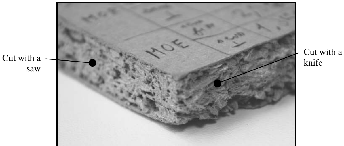
Figure 3: Front of rupture of a wood-cement particleboard cut with a knife (on the right side of the photo; the other side was cut with a saw)

Regarding panel cutting, it can be done with a knife in the same way as for gypsum panels. Although the cut edge of the panel is not as neat as for gypsum (see Figure 3), this is not a major problem because panel joints are usually filled with plaster and covered by paper tape.