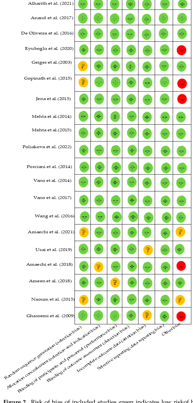
Figure 2. Risk of bias of included studies green indicates low riskof bias [30,31,37–40,43,45–47], orange indicates uncertain or moderate risk of bias [32,34,36,44,49], and red indicates high risk of bias [33,35,41,42,48].

and in the study of Jena et al. [42], because the absence of description of the sample size and of duration and location of the study also constituted a risk of bias.