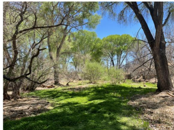
Figure 2b. Cienega Creek at Empire Ranch, Arizona: one of the last remaining perennial creeks of the region.

River restoration, with a focus on groundwater levels eventually allows riparian vegetation (here, cottonwoods, willow, and mesquite trees) to thrive again. In Southern Arizona, this ribbon of green can provide wildlife refuges, and important recreation areas.