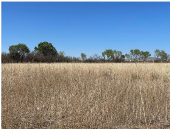
Figure 2a. The riparian forest of the Cienega Creek, Las Cienegas National Conservation Area, Arizona.

collaboration with watershed organizations, researchers have observed that social recognition of the exchange between surface and subsurface is often rooted in the profound sense of loss – or the opposite notion of resurrection – triggered by the disappearance or reappearance of specific fish species or riparian trees. These transformations are readily visible to those intimately acquainted with the river, as highlighted in previous studies (Cunsolo and Landman, 2017; Wölfle-Eskrine et al. , 2017; Eppehimer et al. , 2021). In places where cultures, livelihoods, and landscapes are undergoing significant transformation or even eradication due to groundwater depletion and contamination (Konikow and Kendy, 2005; Bierkens and Wada, 2019; Bessire, 2022), studies focusing on intermittent streams affected by lowering water tables have shown that drying is often associated with cultural constructs surrounding death; both of beloved environments, but also of the associated aquatic and riparian ecosystems (Webb et al. , 2014; Cottet et al. , 2023). Thus, another factor of social recognition for the hyporheic zone, and the importance of shallow groundwater, is the presence of healthy riparian forests (Stromberg et al. , 2005; Logan, 2006; Webb et al. , 2014; Goodrich et al. , 2018), whose cooling functions during increasing heat waves have been recognized (Figure 2a and b).