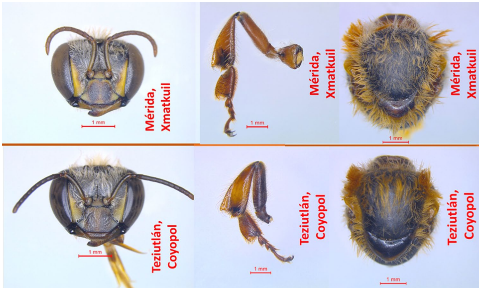
Figure 1. Phenotypic differences between workers of Melipona beecheii from the Yucatan Peninsula (Mérida, Xmatkuil) and Puebla (Teziutlán, Coyopul) on the Mexican Gulf Coast. Genetic analyses are underway to compare these populations.

confirmed by recent analyses of N. perilampoides , the most widely distributed species of stingless bee in the country (Urueña et al. 2022). This species produces little honey but has shown ready adaptation and efficiency in the pollination