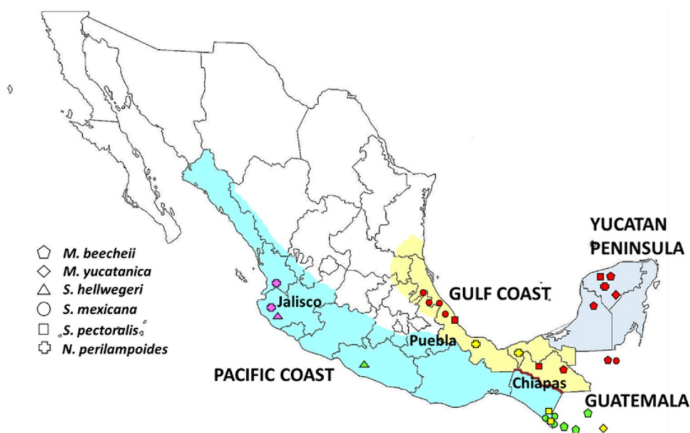
Figure 4. A comprehensive map on the genetic diversity of stingless bees used in meliponiculture in Mexico. Black lines represent the borderlines of the different political states in the country. The regions of the Pacific Coast, Gulf Coast, and the Yucatan Peninsula represent the natural distribution of Meliponini in Mexico, as given by Ayala et al. (2013). Colors indicate separation of these regions by major orographic/climatic barriers (Morrone 2019). Recognized species are indicated with different symbols and different colors of the same symbol indicate findings of significant population differentiation (data from Table I). The mountain system of the Sierra Madre in the south of Mexico is indicated with a brown line in the state of Chiapas and represents a major barrier linked to separation among populations. Specific localities and number of samples analyzed can be consulted from references in Table I.