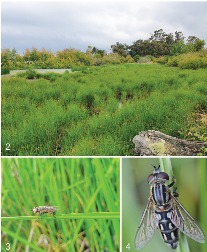
Fig. 2-4. – Lejops vittatus (Meigen, 1822), new species and new genus records from Corsica. – 2, Sampling locality of L. vittatus , marais de Péri. – 3, Male resting. – 4, Female.

Material examined. – 3 males, 9 females.