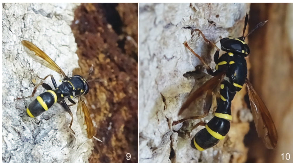
Fig. 9-10. – Sphiximorpha subsessilis (Illiger, 1807), collected 2 km south of Fromontica.

Material examined. – 31 males, 19 females.