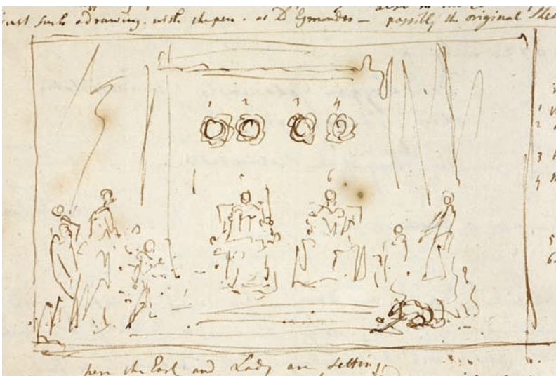
7 Lord Pembroke and his family by Antony van Dyck (1599–1641), 1633/34. Oil on canvas, 330 x 510 cm. Wilton House, Salisbury.

rapidly sketched in black and white chalk on blue, light brown or greenish-grey paper. Consideration had earlier been given to the attitude in which the sitter was to be presented; and preparatory drawings, in the main, indicated the pose. Very seldom does Van Dyck, in these drawings, do more than suggest a likeness ... From a preparatory drawing the “habile gens qu’il avoit chez lui” (“the skilful people he had with him”) could lay out the figures. 6 So what happened to the sketch or sketches for the Arundel family portrait?