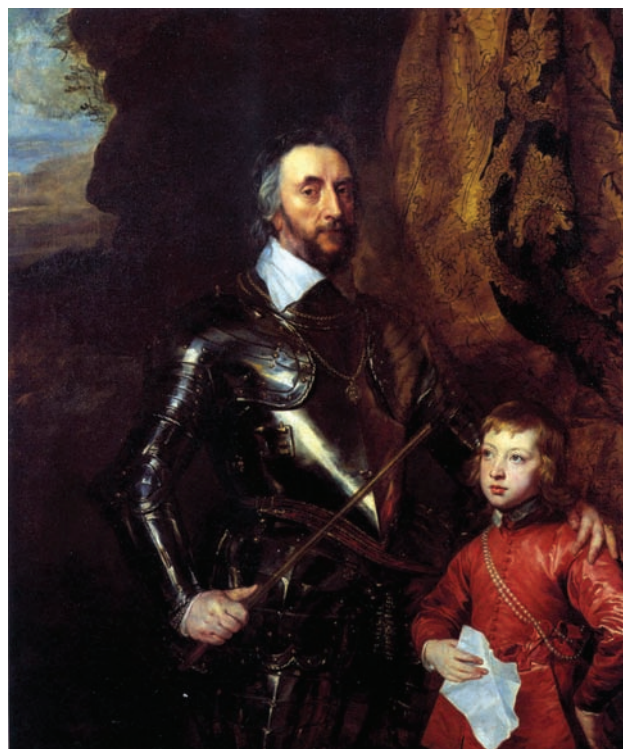
8 Lord Nassau-Siegen and his family by Antony van Dyck, 1634. Oil on canvas, 292.5 x 265 cm. Private collection (Gage family).