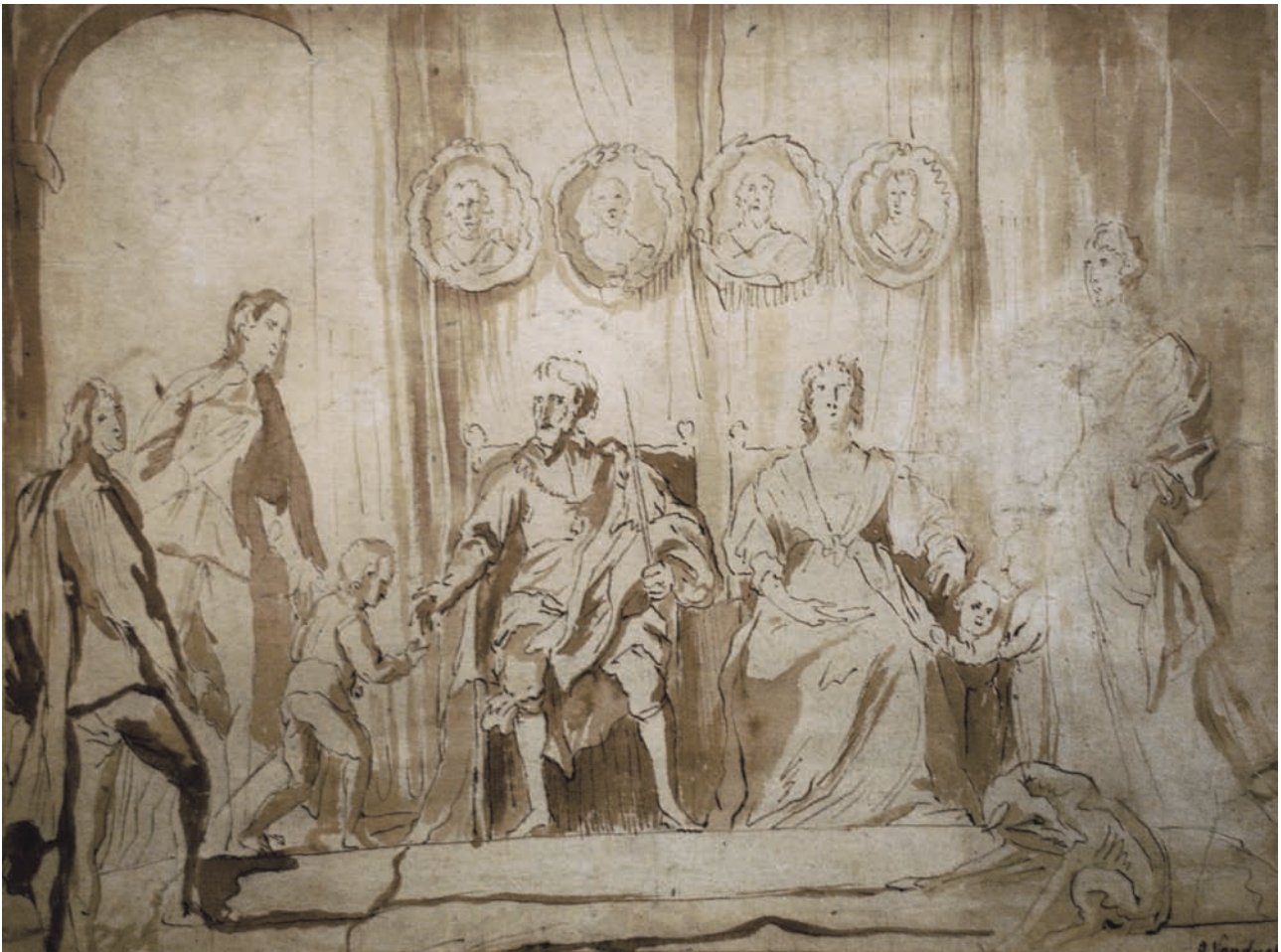
1 Lord Arundel and his family by a contemporary follower of Anthony van Dyck, c1635–1636. Ink and wash drawing, 19.7 x 28.2 cm. Private collection, London.

[not illustrated, but see Appendix 1 below] 2 Lord Arundel and his family by Philip Fruytiers (1610–1666), 1643. Watercolour, 398 x 628 mm. Private collection (Stafford family)