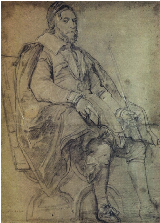
11 Thomas Howard by Antony van Dyck, 1635. Black chalk with white on blue paper, 48.4 x 35.6 cm. British Museum