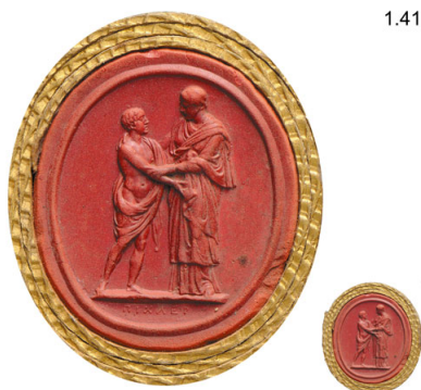
Fig. 4: Cast of an intaglio, by Giovanni Pichler (1734–1791), red sulphur, 27 x 23 mm. (publ.: Tassinari 2012, no. I.41)

but probably no intaglios. An attribution to her father, Friedrich Wilhelm Facius (1764–1843), would seem more plausible: at least, he did indeed engrave intaglios. 14 But in fact the accompanying letter, which seems to associate the ring to the Facius family, was sold separately in the 1908 auction, and may not have been acquired together by Lempertz.