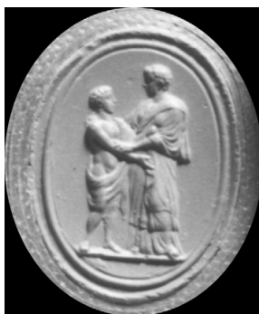
Fig. 7: Cast of an intaglio, Raspe – Tassie 1791, no. 10765.