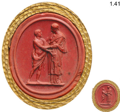
Fig. 4: Cast of an intaglio, by Giovanni Pichler (1734–1791), red sulphur, 27 x 23 mm. (publ.: Tassinari 2012, no. I.41)

but probably no intaglios. An attribution to her father, Friedrich Wilhelm Facius (1764–1843), would seem more plausible: at least, he did indeed engrave intaglios. 14 But in fact the accompanying letter, which seems to associate the ring to the Facius family, was sold separately in the 1908 auction, and may not have been acquired together by Lempertz.