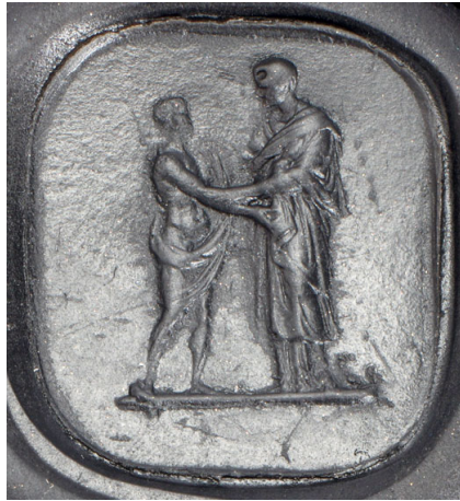
Fig. 2: Impression of the ring.

Lempertz (1816–1898). Sold in the 1908 auction of his estate, 4 the letter (lot 656) and the ring (lot 657) 5 were both purchased by Theodor Sölling (information from Inlibris & Kotte), and remained in his family until 2011. According to Goethe himself, 6 “there may be nothing more difficult than a sure knowledge of engraved stones”, and indeed the description of this ring should be questioned.