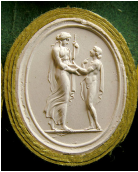
Fig. 6: Cast of an intaglio, attributed to Giovanni Pichler (1734–1791), Amastini no. 26.

highly similar gems 16 (Figs 4–5), but these were signed and it is unlikely that his signature could have disappeared in the reproduction process. Rather: several other such gems exist 17 (even Wedgwood made cameos of this type), 18 and this paste could be the cast of another – unsigned – gem 19 (Figs 6–7), such as the one now kept in the MET (Fig. 8). 20