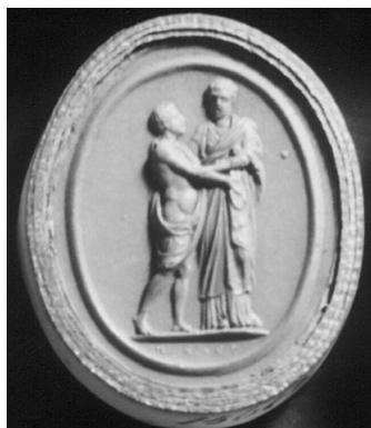
Fig. 5: Cast of an intaglio, by Giovanni Pichler (1734–1791), Raspe – Tassie 1791, no. 15613.

The intaglio is made of glass, and it is most probably the cast of a carnelian or chalcedony intaglio. 15 Giovanni Pichler (1734–1791) carved