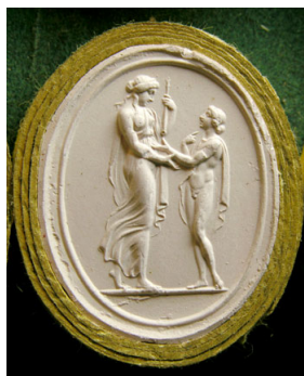
Fig. 6: Cast of an intaglio, attributed to Giovanni Pichler (1734–1791), Amastini no. 26.

highly similar gems 16 (Figs 4–5), but these were signed and it is unlikely that his signature could have disappeared in the reproduction process. Rather: several other such gems exist 17 (even Wedgwood made cameos of this type), 18 and this paste could be the cast of another – unsigned – gem 19 (Figs 6–7), such as the one now kept in the MET (Fig. 8). 20