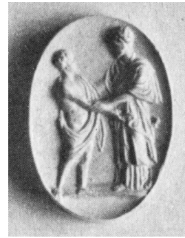
Fig. 8: Convex carnelian intaglio, 21.43 x 15.48 x 5.16 mm (Metropolitan Museum of Art, New York, inv. 81.6.253, gift of John Taylor Johnston, 1881).

In summary, the Lempertz-Christie's ring is undoubtedly a genuine late Georgian/Biedermeier gold ring, set with a paste-impression. The Goethe-provenance is not proven, nor is Angelica Facius' authorship: