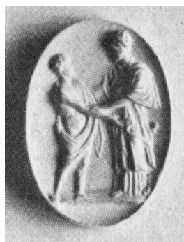
Fig. 8: Convex carnelian intaglio, 21.43 x 15.48 x 5.16 mm (Metropolitan Museum of Art, New York, inv. 81.6.253, gift of John Taylor Johnston, 1881).

In summary, the Lempertz-Christie's ring is undoubtedly a genuine late Georgian/Biedermeier gold ring, set with a paste-impression. The Goethe-provenance is not proven, nor is Angelica Facius' authorship: