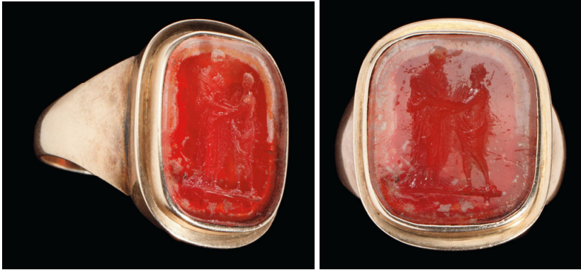
Fig. 1: Views of the ring. The gem: 19 x 15 mm.

A large gold ring (Fig. 1), set with an oval paste-intaglio of 19 x 15 mm (Fig. 2), together with a letter by Johann Wolfgang von Goethe (1749–1832) 1 (Fig. 3) was recently sold in New York by Christie's, 2 where purchased by Antiquariat Inlibris (Vienna) & Kotte Autographs (Ross-haupten) and published in their 2012 catalogue. 3 Both catalogues described this ring as having been previously owned by Goethe, and engraved c. 1826 by Angelica Facius (1806–1887). At a later stage (and no source of acquisition is known), it became the property of Heinrich