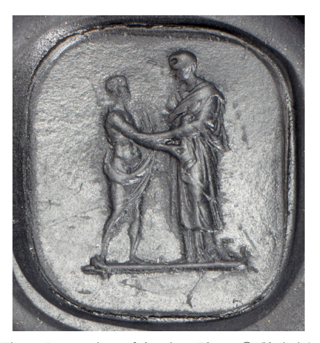
Fig. 2: Impression of the ring.

Lempertz (1816–1898). Sold in the 1908 auction of his estate,<sup>4</sup> the letter (lot 656) and the ring (lot 657)<sup>5</sup> were both purchased by Theodor Sölling (information from Inlibris & Kotte), and remained in his family until 2011. According to Goethe himself,<sup>6</sup> "there may be nothing more difficult than a sure knowledge of engraved stones", and indeed the description of this ring should be questioned.