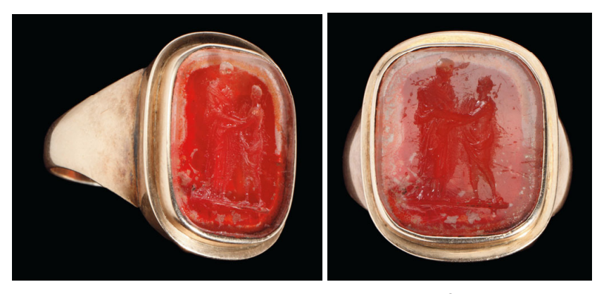
Fig. 1: Views of the ring. The gem: 19 x 15 mm.

A large gold ring (Fig. 1), set with an oval paste-intaglio of 19 x 15 mm (Fig. 2), together with a letter by Johann Wolfgang von Goethe (1749–1832)<sup>1</sup> (Fig. 3) was recently sold in New York by Christie's,<sup>2</sup> where purchased by Antiquariat Inlibris (Vienna) & Kotte Autographs (Rosshaupten) and published in their 2012 catalogue.<sup>3</sup> Both catalogues described this ring as having been previously owned by Goethe, and engraved c. 1826 by Angelica Facius (1806–1887). At a later stage (and no source of acquisition is known), it became the property of Heinrich