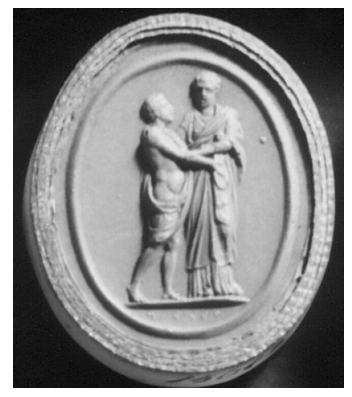
Fig. 5: Cast of an intaglio, by Giovanni Pichler (1734–1791), Raspe – Tassie 1791, no. 15613.

The intaglio is made of glass, and it is most probably the cast of a carnelian or chalcedony intaglio. <sup>15</sup> Giovanni Pichler (1734–1791) carved