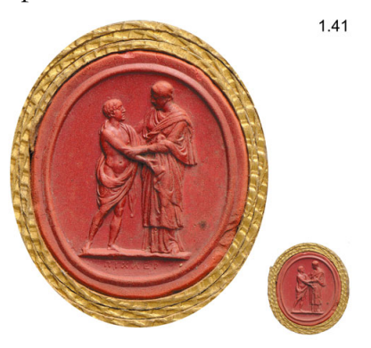
Fig. 4: Cast of an intaglio, by Giovanni Pichler (1734–1791), red sulphur, 27 x 23 mm. (publ.: Tassinari 2012, no. I.41)

but probably no intaglios. An attribution to her father, Friedrich Wilhelm Facius (1764–1843), would seem more plausible: at least, he did indeed engrave intaglios. But in fact the accompanying letter, which seems to associate the ring to the Facius family, was sold separately in the 1908 auction, and may not have been acquired together by Lempertz.