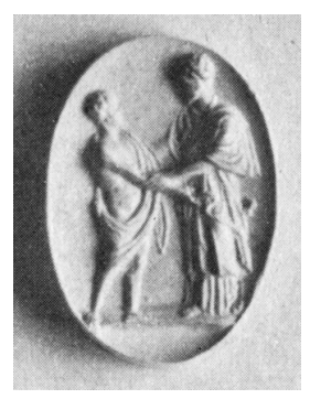
Fig. 8: Convex carnelian intaglio, 21.43 x 15.48 x 5.16 mm (Metropolitan Museum of Art, New York, inv. 81.6.253, gift of John Taylor Johnston, 1881).

In summary, the Lempertz-Christie's ring is undoubtedly a genuine late Georgian/Biedermeier gold ring, set with a paste-impression. The Goethe-provenance is not proven, nor is Angelica Facius' authorship: