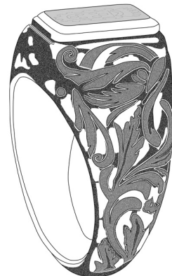
Figs 4-4a Two views of a finger-ring in gold and steel, set with a diamond engraved of the Medici arms, sold by Prince Luigi Alberico Trivulzio. Drawing by Thorsten Linsner © H.J. Rambach.