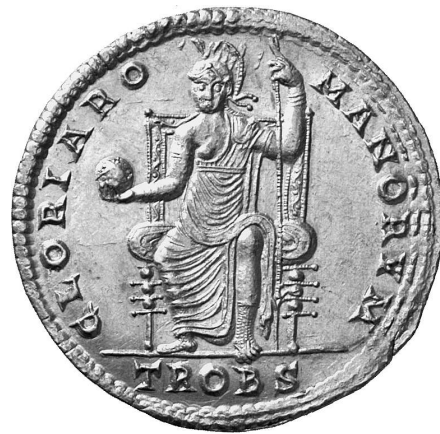
Figs 2-2a Gold medallion of Valens (AD 364-378), depicted on the portrait of Don Carlo Trivulzio. Photo © N.A.C. (auction 21 – lot 577).