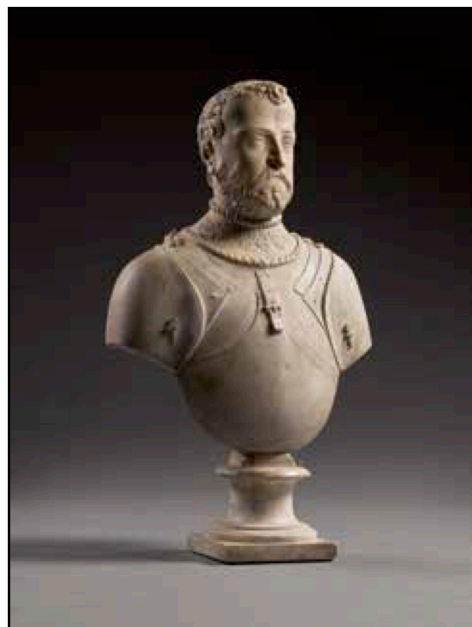
Fig. 4. Ascribed to Prospero Spani « il Clemente », Bust of Leonello II d'Este, around 1560/70, marble, 96 x 57 cm. Auction in London, 6 July 2017, lot 76.

(future Saint) Charles Borromeo (1538-1584) 8 , and in 1589 he considered acquiring the collection of the antiquarian Jacopo Strada (1507-1588) 9 .