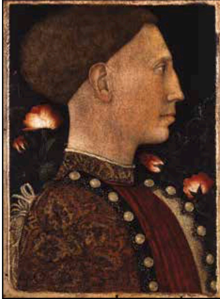
Fig. 3. Antonio Pisano, a.k.a. « Pisanello », Bust of Leonello II d'Este , around 1441, oil on canvas, 28 × 19 cm. Accademia Carrara (Bergamo), inv. 58MR00010, formerly in the Giovanni Morelli collection (1891).

1614. It is believed that, out of 12,000 to 15,000 coins in the Este collection, some 1,500/2,000 were countermarked. This exceptional collection was initiated by Leonello d'Este (1407-1450), Marquis of Ferrara, patron of the medallist Pisanello, who had started to buy before 1430 3 , mostly bronze coins 4 . Ercole I d'Este (1431-1505), who owned 437 ancient gold coins in 1494 5 , had notably acquired coins from the collection of the late Pope Paul II (Pietro Barbo, 1417-1471). Then, his son Alfonso I d'Este (1476-1534) asked the painter Raphael his help to find “ antique medals, heads and figures ” 6 . A catalogue was established 1538/41 under the rule of Ercole II d'Este (1508-1559), by which time the collection contained 783 ancient gold coins 7 . Finally, the collection reached its peak under Alfonso II d'Este (1533-1597), who continued to acquire coins: for example, in 1568 he was offered the collection of Cardinal