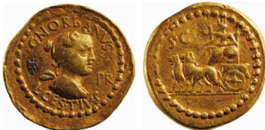
Figs 1-2. Aureus struck in Rome in January-April 43 BC, in the name of moneyers Lucius Cestius and Gaius Norbanus Flaccus. Weight 7.97 grams. On the obverse, the draped bust of Sibyl. On the reverse, Cybele enthroned in a biga of lions. Private collection.

Luckily, a definite answer can be given: the countermarked coins belonged to the Este family before the merger of their collection with the Gonzaga's. Indeed, when Alfonso II d'Este died childless in 1597, his belongings were inherited by his cousin Ce-