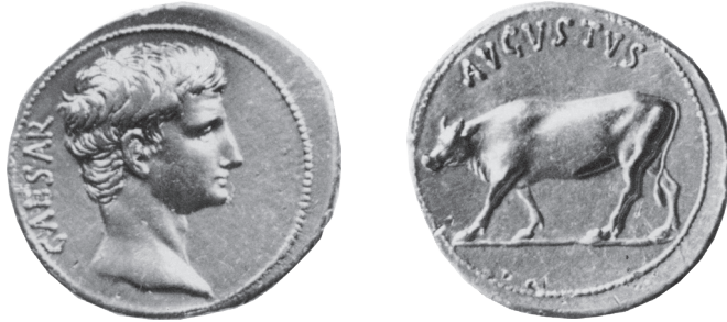
Fig. 1: Specimen 1.13

Specimen 1. forgery 2: A (fake) example was offered by Art Coins Roma in October 2014. 11 It is struck with the dies O.4 and R.5, measures 19 mm diameter, weighs 7.89 grams, and shows a 12:00 die-axis.