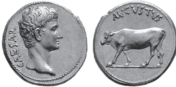
Fig. 3: Specimen 1.15

weight and die-axis are unknown. 16 Its appearance is fortunately preserved by a precise engraving by Léon Dardel (Fig. 2). 17