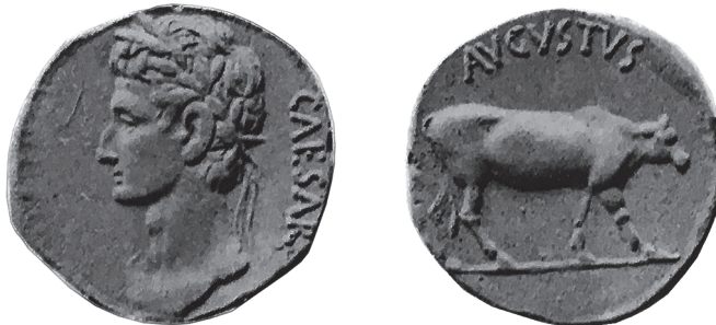
Fig. 4: Specimen 4.6

Specimen 4.5: This example is preserved in Brussels, at the Cabinet des Médailles de la Bibliothèque royale de Belgique (cf. article von Mosch, Abb. 4). It comes from the collection of Count Albéric du Chastel de la Howardries (1842–1919) and was published in Callataÿ – van Heesch 1999, no. 367. It is struck with the dies O.6 and R.7, measures 18.5 mm diameter, weighs 7.98 grams, and shows a 12.00 die-axis.