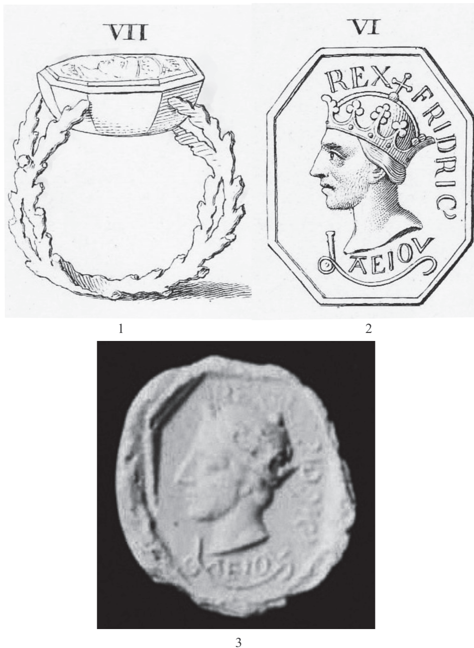
Pl. 3: 1-3 – Gold ring set with a sapphire intaglio portrait of Frederick III (1452-1493).