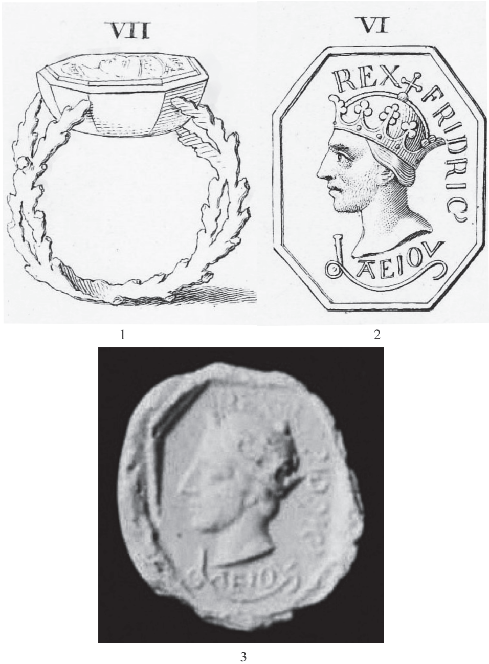
Pl. 3: 1-3 – Gold ring set with a sapphire intaglio portrait of Frederick III (1452-1493). Reproduced from Giuliani 1760-65, 390 (drawings) and Squizzato 2014, 298 (cast)