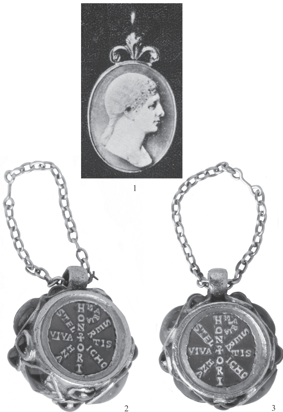
Pl. 1: 1 – Hardstone cameo depicting a Flavian lady, probably a Roman work of the 1st century AD. Reproduced from Seregni 1927, tav. XIV