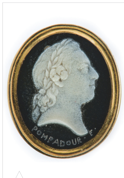
FIGURE 5: Gold ring, set with a cameo in onyx, 16 x 13 mm, depicting French King Louis XV, signed POMPADOUR F. European private collection.

prived of blood-circulation and that this may have accelerated his death. It was therefore very exciting when, in December 2007, his own Papal ring was offered at auction (Figure 3). It displayed an intaglio with Peter and Paul's portraits separated by a cross, and the Pope's titles on the reverse in cameo.