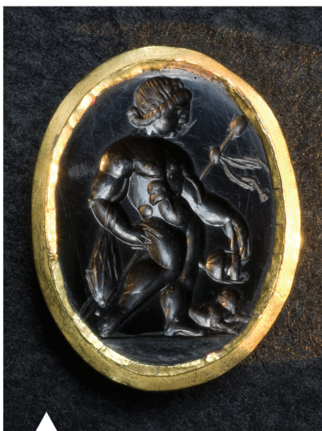
FIGURE 1: Ancient gold pendant, set with a Hellenistic intaglio in sard, 34.7 x 27.2 mm, depicting Dionysos pouring wine into the mouth of a panther. European private collection.

The technical difference in difficulty between carving a hard-stone and a shell is enormous. As explained in an article of the late 1880s (John B. Marsh, "Cameo-cutting as an occu-