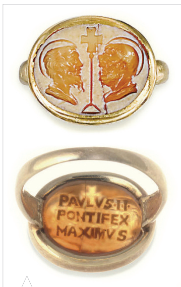
FIGURE 3: Modern gold ring, set with an engraved sardonyx, depicting the facing profiles of Saints Peter and Paul divided by a processional cross on stand, the reverse inscribed in relief PAVLVS II PONTIFEX MAXIMVS, engraved in 1464 for the newly elected Pope Paul II. Current location unknown.