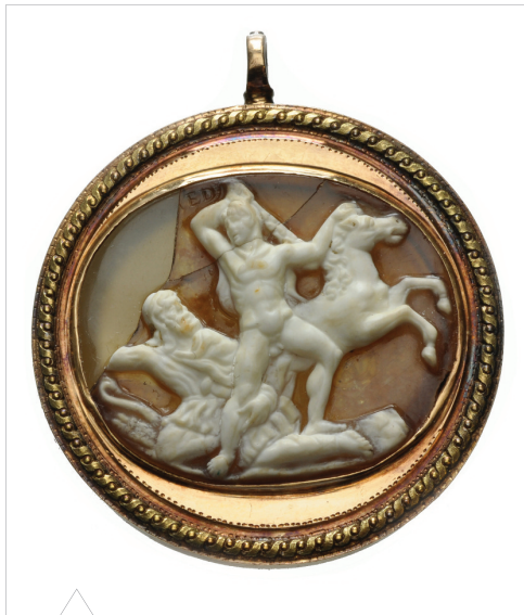
FIGURE 4: Modern gold pendant, set with a Roman onyx cameo, 27 x 31 mm, depicting the combat between Hercules and the Thracian Diomedes, with the ownership-inscription of Lorenzo de' Medici (1449-1492). Private collection, on loan to the Getty Museum.