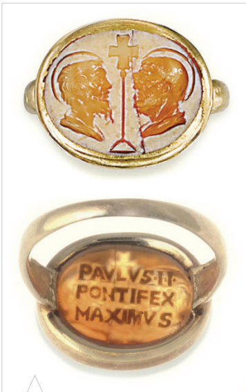
FIGURE 3: Modern gold ring, set with an engraved sardonyx, depicting the facing profiles of Saints Peter and Paul divided by a processional cross on stand, the reverse inscribed in relief PAVLVS II PONTIFEX MAXIMVS, engraved in 1464 for the newly elected Pope Paul II. Current location unknown.