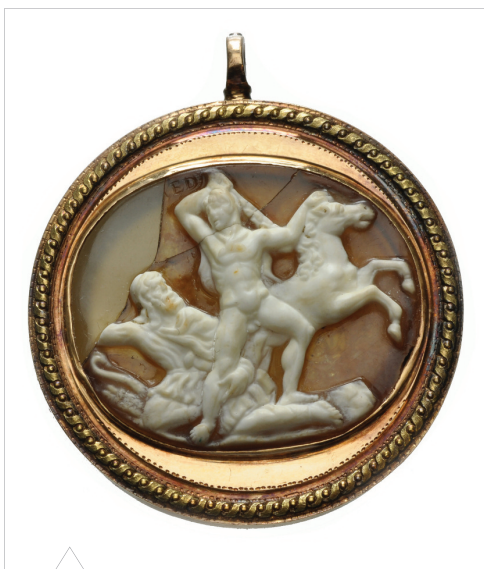
FIGURE 4: Modern gold pendant, set with a Roman onyx cameo, 27 x 31 mm, depicting the combat between Hercules and the Thracian Diomedes, with the ownership-inscription of Lorenzo de' Medici (1449-1492). Private collection, on loan to the Getty Museum.