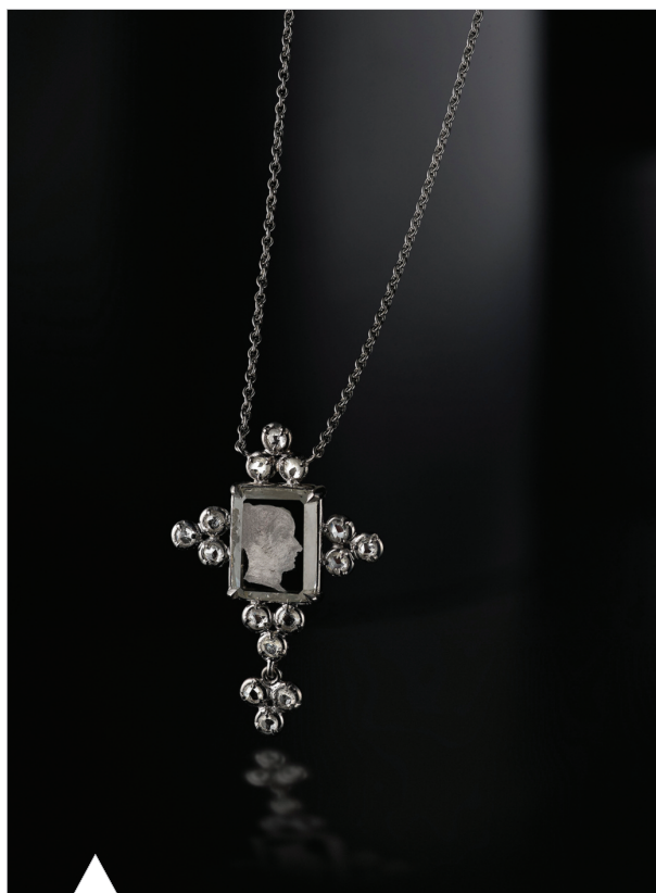
FIGURE 2: Modern gold pendant by Maison Auclert (2013), set with a 1.88 carat diamond, 10 x 8 mm, depicting Dutch Queen Frederica Louisa Wilhelmina. European private collection.

Later, in Germany and France especially, the late Middle Ages goldsmiths re-used ancient gems in the reliquaries and crosses. They were using them for their magical virtues, or their colours, rather than their beauty. For example, many intaglios would be mounted inverted, with no possibility to see the carving.