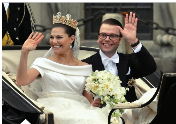
FIGURE 7: Wedding cortege of Victoria, Crown Princess of Sweden, in Stockholm on 19 June 2010. She is depicted wearing a cameo crown executed for Empress Josephine – wife of Napoleon.

The fashion of cameos and intaglios declined after the Battle of Waterloo, but there was a renewed fashion when jewelers developed the "archaeological style" in the second half of the nineteenth-century. The most celebrated house is that of Castellani, with its luxurious shop on Fontana di Trevi in Rome.