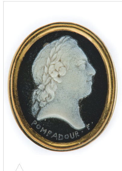
FIGURE 5: Gold ring, set with a cameo in onyx, 16 x 13 mm, depicting French King Louis XV, signed POMPADOUR F. European private collection.

prived of blood-circulation and that this may have accelerated his death. It was therefore very exciting when, in December 2007, his own Papal ring was offered at auction (Figure 3). It displayed an intaglio with Peter and Paul's portraits separated by a cross, and the Pope's titles on the reverse in cameo.