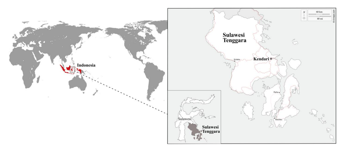
Figure 1. Location of Kendari city, Province of Sulawesi Tenggara, Indonesia.