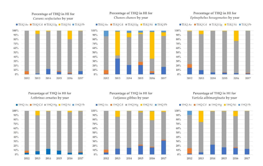
Figure 3. Part of each metal-specific THQ (in percentage) in the global HI for different species and years. Colors for the various metals are given inside the figure.