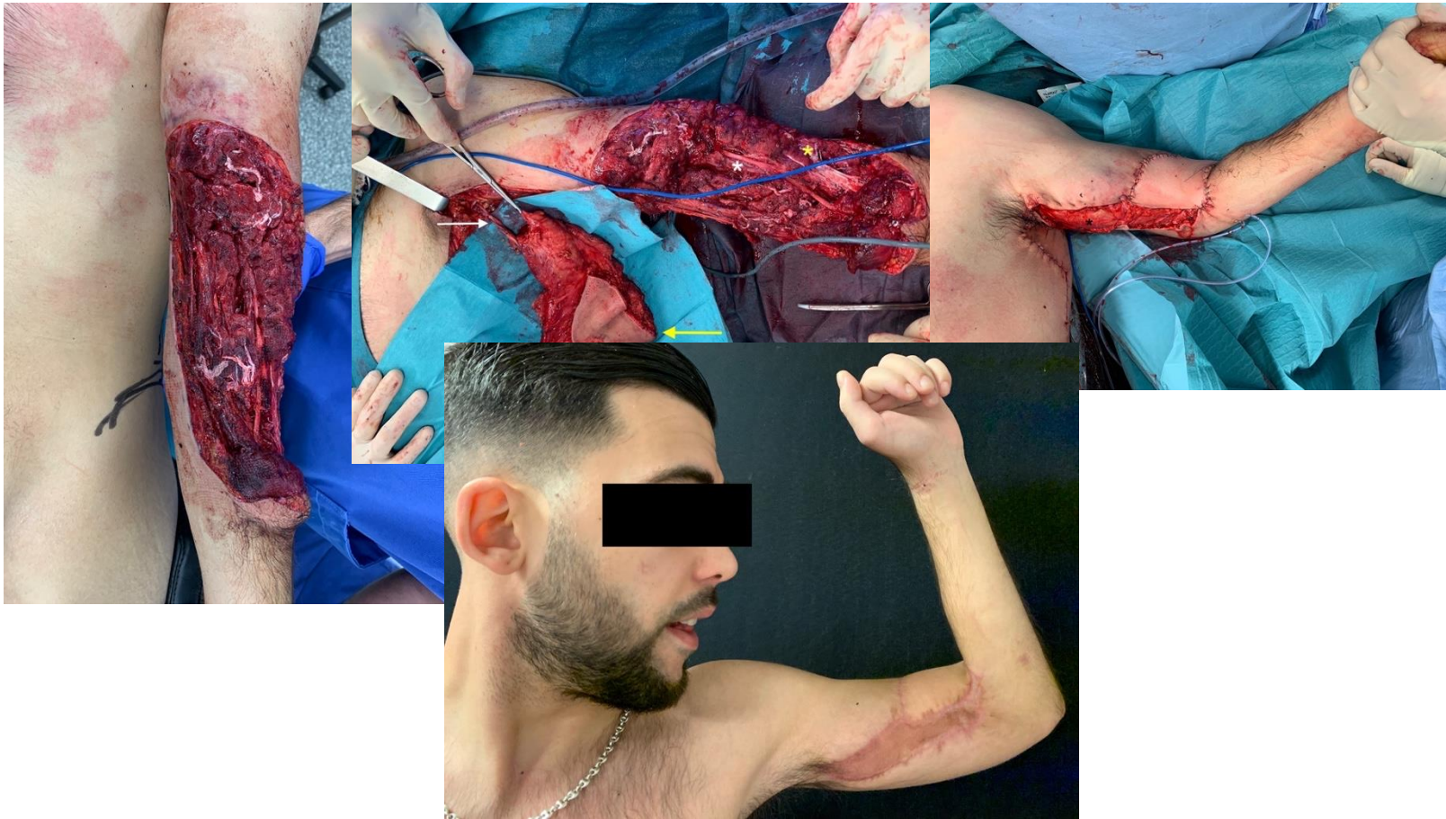
Figure 3. Case of a 19-year-old man with an open transolecranon fracture initially treated with an external fixator. A wound infection led to debridement, screwed-plate-based osteosynthesis, and the resulting defect was covered by a combination of a pedicled brachioradialis flap and an acellular dermal matrix prior to skin grafting.

(D) Final result. Complete wound healing, with a satisfactory aesthetic and functional outcome at four months follow-up.