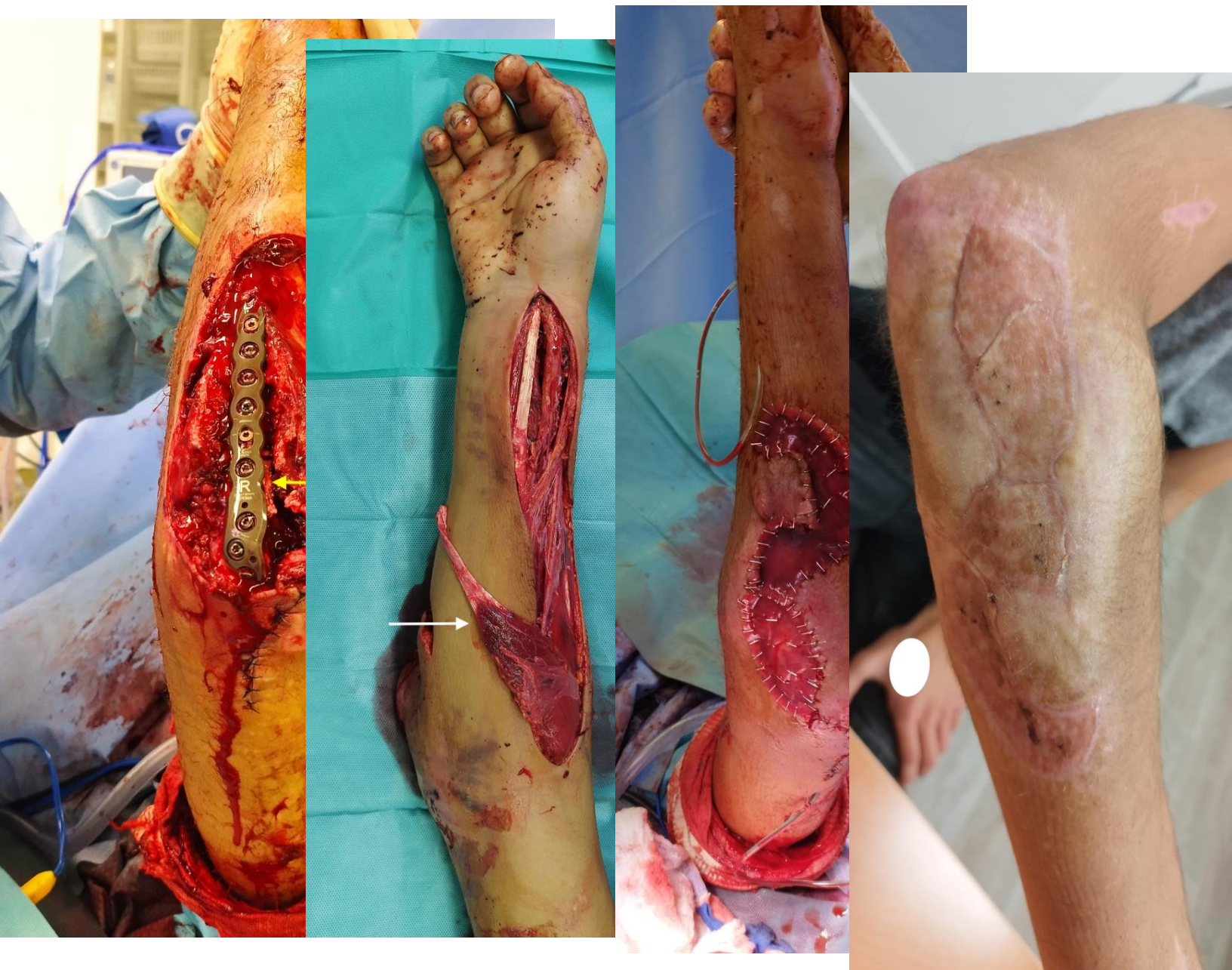
Figure 4. Case of a 58-year-old woman presenting with radiodermatitis and bone exposure following radiotherapy. A wide soft tissue resection with bone trimming was performed, and the defect was covered using a free ultrathin SCIP flap, resulting in optimal coverage. (A) Radiodermatitis and exposure of the radius after surgery and postoperative adjuvant radiotherapy. (B) Free SCIP flap raised in supra-thin fashion.