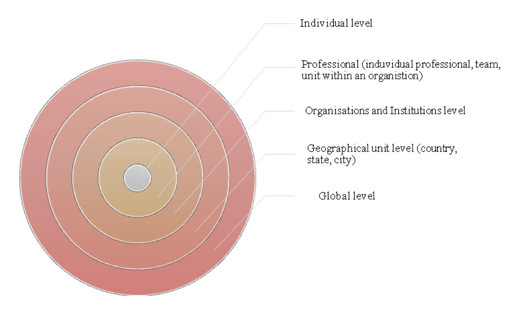
Figure 1. Multi-tier cake, view from above illustrating the multi-level nature of transformation

The analysis included several stages. First, we perused, systematized, and inductively coded the collected data. This process comprised different tasks: an overview, labelling, organization, and provisional identification of key themes and the relationships between them. After synthesizing this work with the literature, the main themes were tentative multiple levels of impact (Figure 1), various multifaceted dimensions (Figure 2), disadvantages and difficulties for the industry and stakeholders (challenges), and finally, new unexpected opportunities. In a ddition, at this stage,