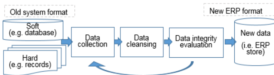
Fig. 1. Data Migration principal steps with integrity after collecting and cleansing of data.

For business applications, data migration process aims to transfer/convert data originally founded in the old system into formats that are suitably conform to the new system purpose. This data can be in hard, e.g. catalogues or booklets, or soft records, e.g. databases. In modern systems, data is in digital formats, although it is distributed among enterprises departments or branches. In further complexity, modern enterprises switch on premise infrastructure and applications to cloud-computing models, i.e. cloud-based storage and apps, to allow users to store, access, and modify their data on the internet through a cloud service provider. Service providers are responsible for managing and operating this data storage as a service (SaaS). Enterprises subscribe to a specific data storage capacity, usually in a pay-as-you-go model [3]. In this model, data synchronization and downloading are necessary. Hence, data migration consist converting hard records and soft data into required digital formats in order to be ready for manipulation by computer software. The process also could be to convert from old distributed databases to new centralized ERP database as depicted by Fig.1.