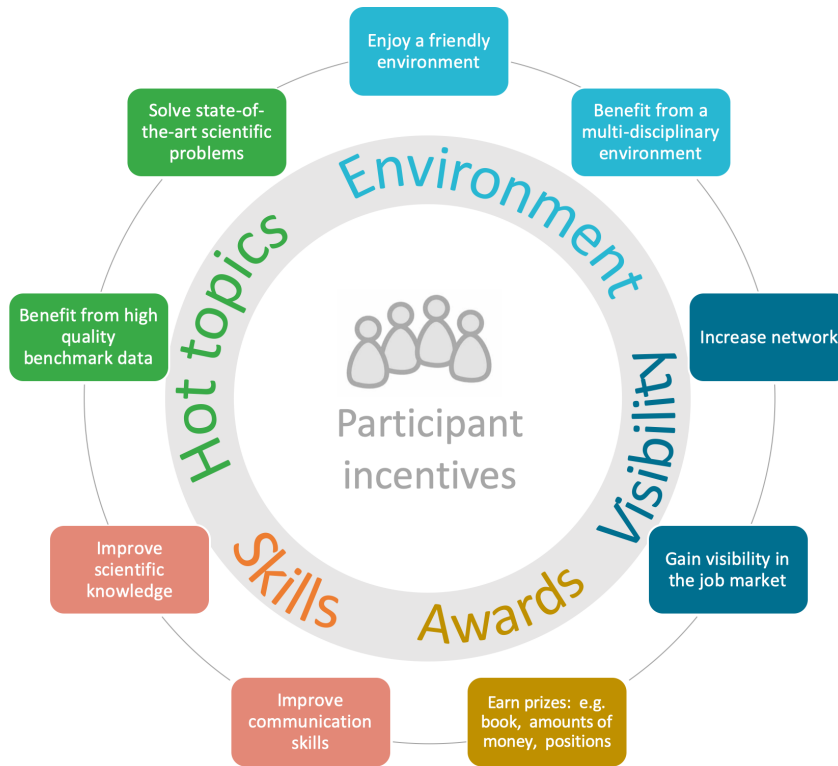
Fig. 1.1: The incentives for participating in a challenge.