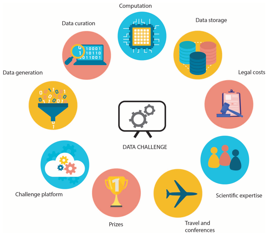
Fig. 1.3: Costs of data challenge organization. Pictures adapted from: macrovector, alvaro_cabrera, visnezh & vectorjuice open work on freepik

sociated costs. Please refer to Chapter 5 for more details on the different services provided by each platform.