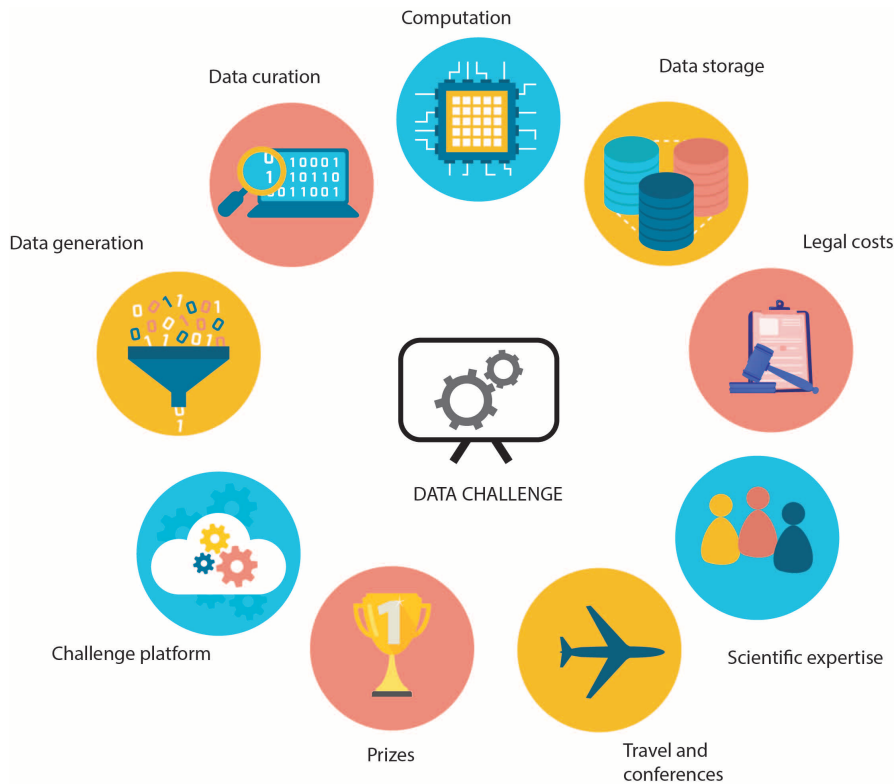
Fig. 1.3: Costs of data challenge organization. Pictures adapted from: macrovector, alvaro_cabrera, visnezh & vectorjuice open work on freepik

sociated costs. Please refer to Chapter 5 for more details on the different services provided by each platform.