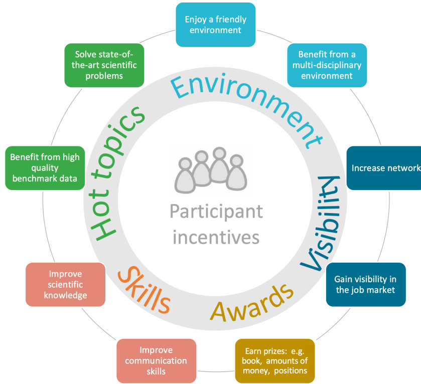
Fig. 1.1: The incentives for participating in a challenge.