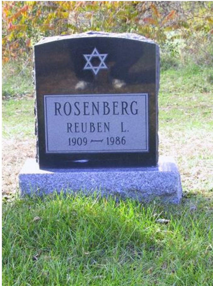
Fig. 5. The grave of Reuben Louis Rosenberg.

Beginning of the first section of Rosenberg's thesis [3]: