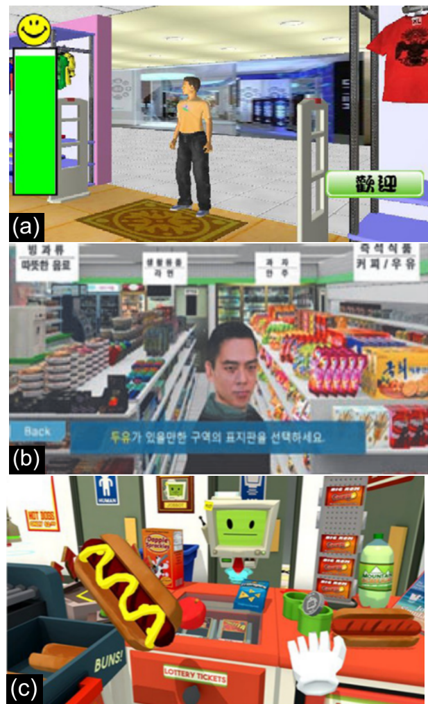
Fig. 2. Example of VR applications: (a) Virtual clothes store as an employee [50], (b) Virtual convenience store as a customer [9] and (c) Virtual supermarket as a cashier [54].

Patients with cognitive impairment also have various preserved abilities and face different challenges that rehabilitation programs need to take into account. Each patient integrates the rehabilitation results at their own pace, and therapy is always personalized depending on the patient. In VE, such adaptivity is hard to achieve because the scenario and series of actions must be decided beforehand. In the presented studies, adaptivity is partially achieved with different difficulty levels based on the user's progress [29], [31]. When the task is easily performed (based on performance speed or success rate), the difficulty goes up, otherwise the participants might