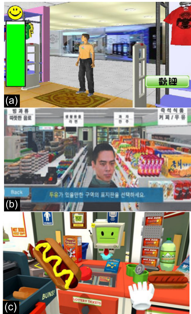
Fig. 2. Example of VR applications: (a) Virtual clothes store as an employee [50], (b) Virtual convenience store as a customer [9] and (c) Virtual supermarket as a cashier [54].

Patients with cognitive impairment also have various preserved abilities and face different challenges that rehabilitation programs need to take into account. Each patient integrates the rehabilitation results at their own pace, and therapy is always personalized depending on the patient. In VE, such adaptivity is hard to achieve because the scenario and series of actions must be decided beforehand. In the presented studies, adaptivity is partially achieved with different difficulty levels based on the user's progress [29], [31]. When the task is easily performed (based on performance speed or success rate), the difficulty goes up, otherwise the participants might