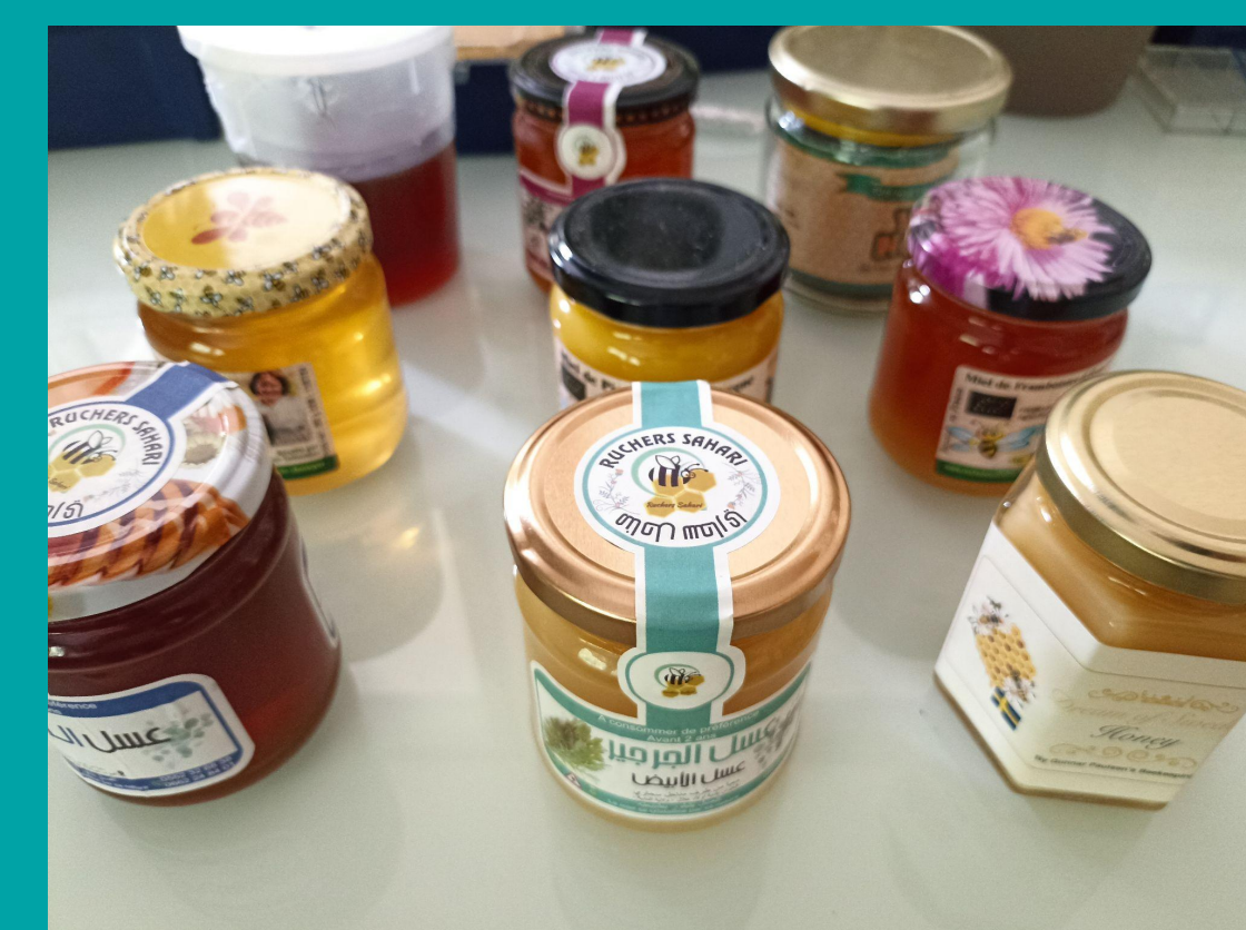
Fig. 2: Diversity of the honey samples to be included in our future investigations for the Mallaurie project (on this picture: honeys from Algeria, India, Nepal, Sweden, ...)

Our pilot study is part of a larger project (called Mallaurie ) including 100+ samples, with a larger honey diversity (different geographical origins and plant species, different A. mellifera subspecies, Fig. 2). Thanks to this larger diversity, we will perform a metagenomic analysis of all DNAs present in honey . This will allow us to propose a potential geographical origin of the honeys by comparing the sequencing results (plants and bees) from honey samples with the genetic structure described above (Fig. 1).