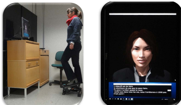
Figure 1. Experimental setup.

In the second phase, participants performed two sessions of physical activity on a stepper, with a break in between to allow for rest. The first session was the same for all participants and was a controlled trial. The task was to take as many steps as possible, with a maximum of 1500 steps. Participants' progress was tracked using a connected watch, and feedback (the achieved number of steps) was displayed every 65 seconds on a computer screen facing the participant ( Figure 1 ).